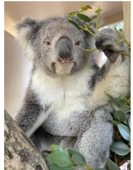
Female koala at Cleland Wildlife Park