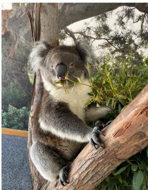
This is Bungee the koala munching on delicious tip

It is true that koalas eat only eucalyptus leaves, however they are quite picky about which ones they eat. There are over 700 species of eucalyptus, but koalas will only eat around 50 of them, often sticking to just 1-3 species found within their local area. Before eating, koalas sniff the leaves to check toxin levels to determine whether they are safe to consume.