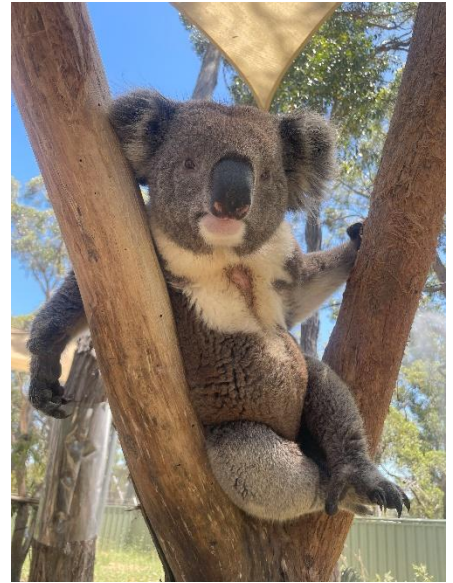
Male koala at Cleland Wildlife Park

Although koalas look cute, they have very sharp claws for climbing and living in trees and have sharp teeth for snip through tough eucalyptus leaves.