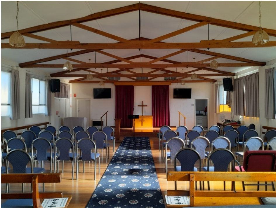
Interior of chapel, view towards sanctuary