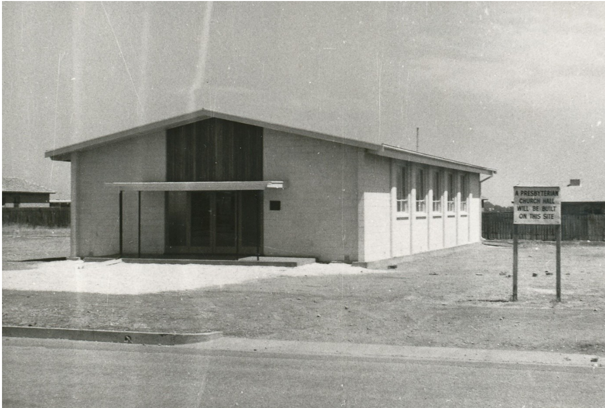
The newly-completed Jean Flynn Presbyterian Church, c.1957

By the time Jean Flynn Presbyterian Church opened, the local population had grown to 6,000 and continued to rise. 58 A fenced netball court, paved with asphalt was later built on the allotment to the south of the church.