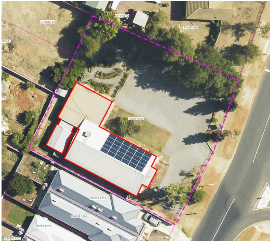
Jean Flynn Presbyterian Church (CT 5663/32 A725 D6033 Hundred of Munno Para)*

Elements of heritage significance include (but are not necessarily limited to):