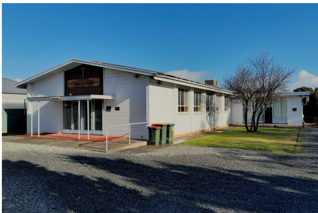
Jean Flynn Presbyterian Church

This heritage assessment considers that the place meets criterion (a). Refer to Summary of State Heritage Place for final approved wording, including criteria statements.