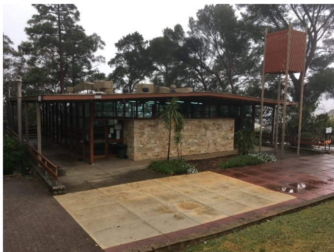
Nunyara Chapel (SHP 14785)