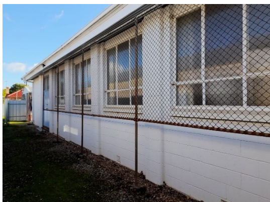
Freestanding chain-mesh fence structure protecting windows on southern side