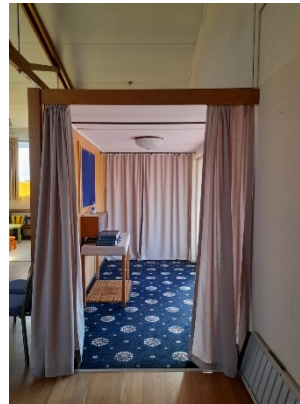
View from chapel looking into narthex