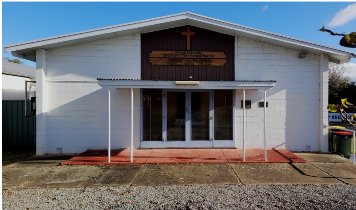
Jean Flynn Presbyterian Church, front elevation of chapel