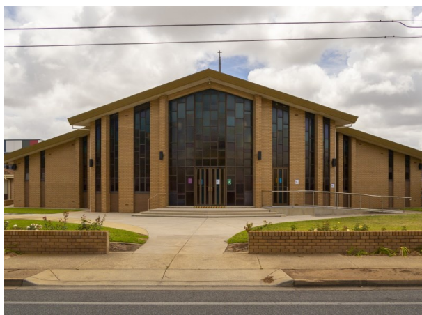
Immanuel Lutheran Church, North Adelaide, 1956 (left) and St Margaret Mary's Catholic Church, Croydon Park, 1968 (SHP 26521) (right) are both gable-roofed churches.