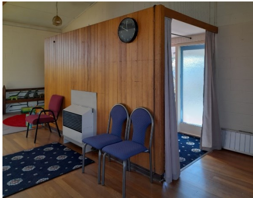
Narthex structure in chapel