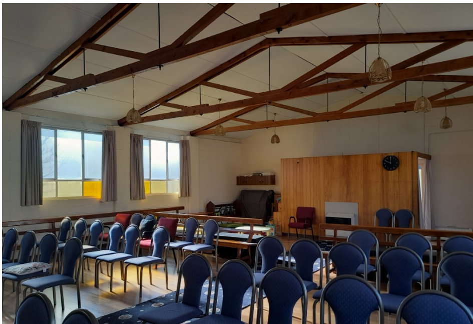
Interior of chapel, view towards entry