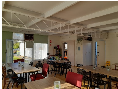
Interior of hall looking towards entrance