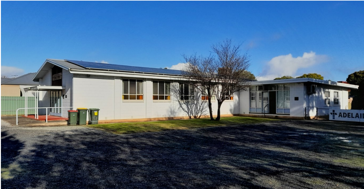
Jean Flynn Presbyterian Church, showing chapel (left) and hall (right)

All images in this section are from DEW Files and were taken on 15 July 2024, unless otherwise indicated.