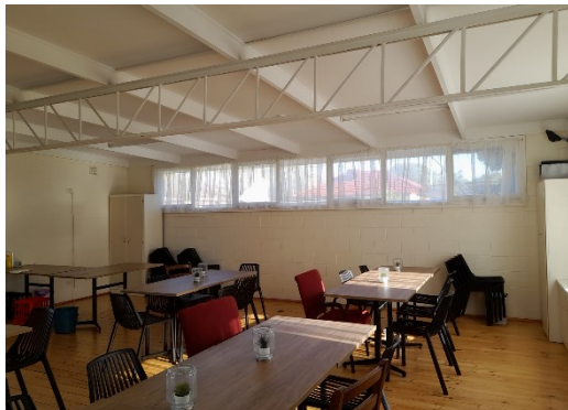
Interior of hall viewed from entrance