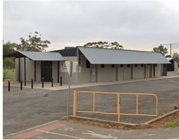
Former Anglican Mission, 1959 (LHP) (left) and Ridley Reserve clubroom complex (right), note recent awning structures, 1957