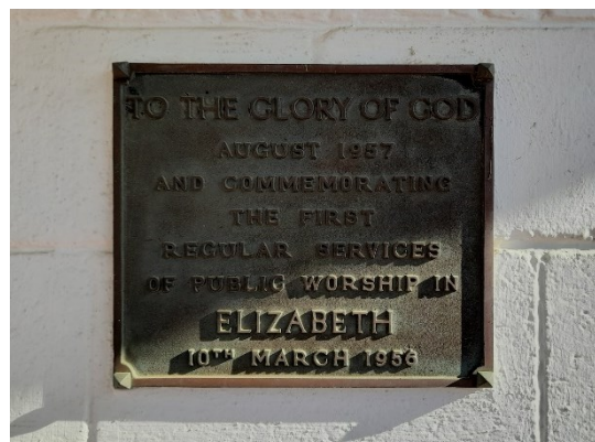
Dedication plaque adjacent to chapel entrance