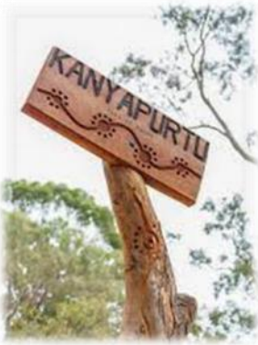
This sign means Full of Rocks