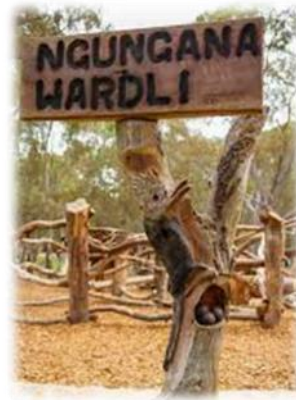
This sign means Kookaburra's nest