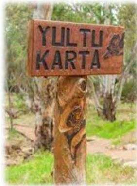
This sign means Frog