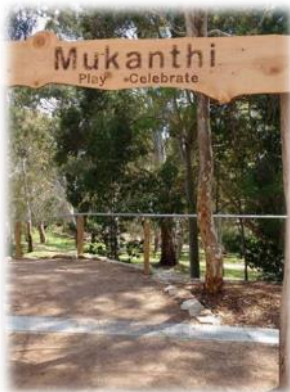
This sign means Play or celebrate