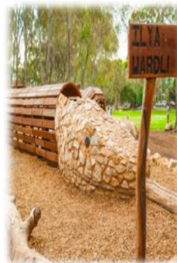
This sign means Red bellied black snake