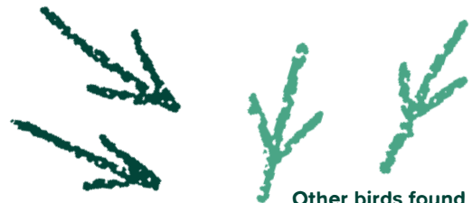
Warraty - emu