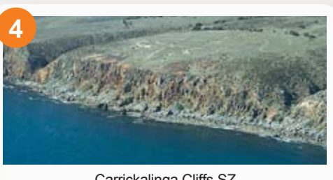
Carrickalinga Cliffs SZ Shallow reefs fringing the cliffs support some of the highest diversity of fish species recorded in Southern Australia.