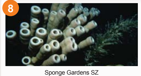
One of only two known deep sea trenches in SA waters and home to huge sponges often more than a metre in diameter.