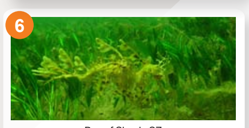
Bay of Shoals SZ Highly important nursery area for a wide range of marine animals. Tidal flats provide an important feeding area for local and migratory shorebirds.