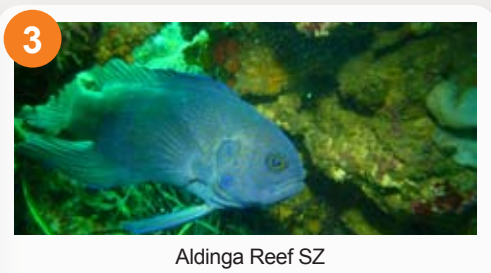
Aldinga Reef SZ Iconic reef that's been a reserve since 1971 Excellent research opportunities. One of the best dive sites in SA.