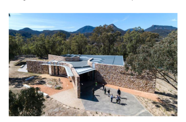
Warrumbungle National Park Visitor Centre