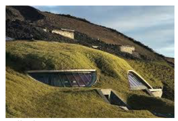
Cliffs of Moher Visitor Centre