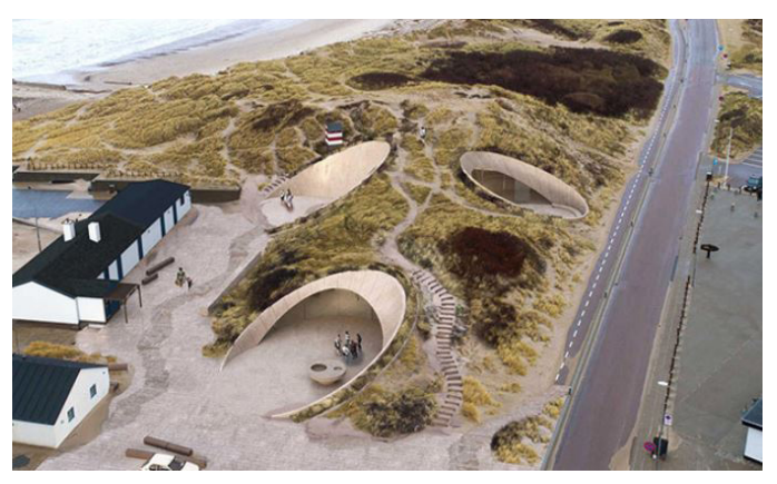
Thy National Park centre under dunes, Denmark