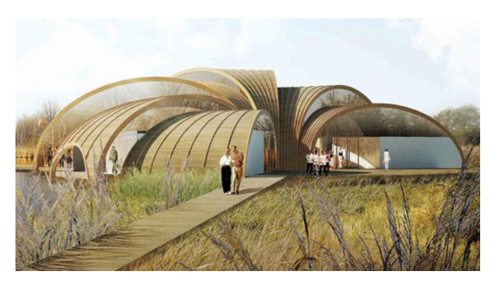
Great Fen Visitor Centre, UK