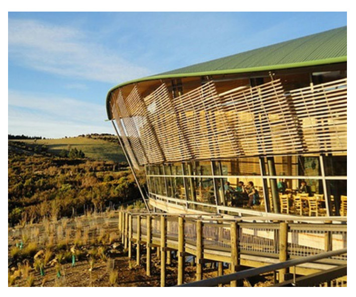
Ecosanctuary Visitor Centre, Dunedin