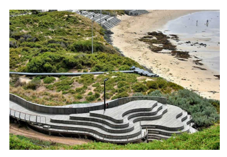
Penguin Parade Visitor Centre, Philip Island