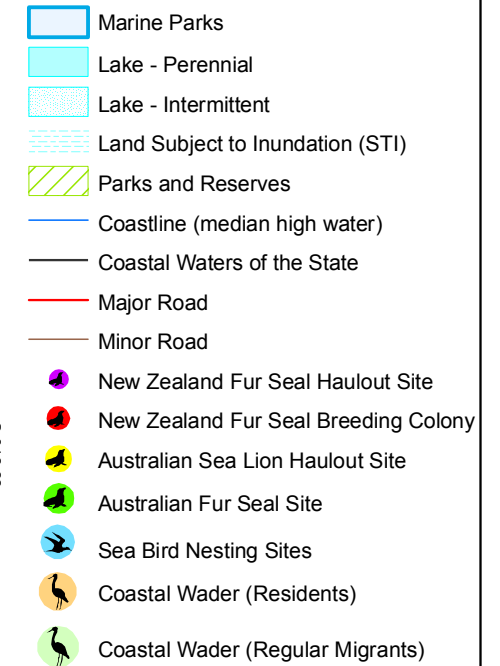
Figure 9: Western Kangaroo Island Marine Park Seabirds, Coastal Waders, Fur Seals and Sealions