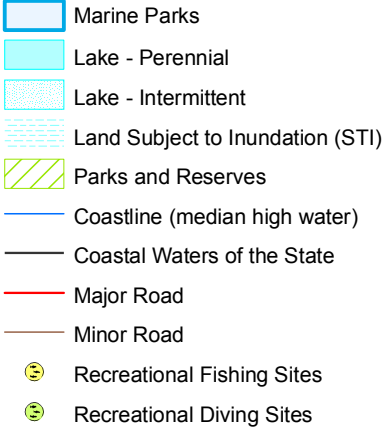
Figure 14: Western Kangaroo Island Marine Park Published Recreational Fishing Sites (1998) and Diving Sites

Pescatore and Ellis 'Country GPS Marks in South Australia', 1998