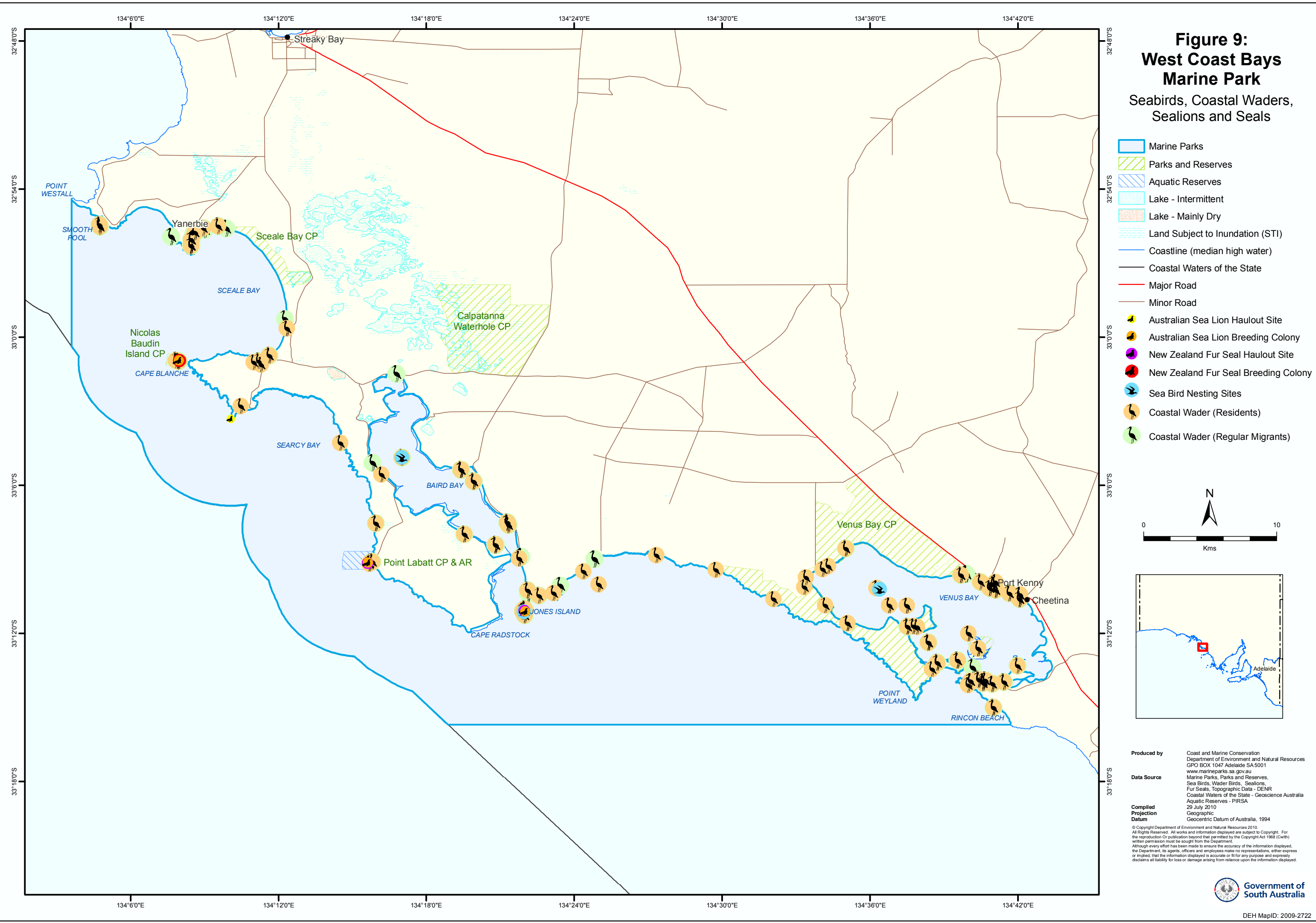
Figure 9: West Coast Bays Marine Park Seabirds, Coastal Waders, Sealions and Seals