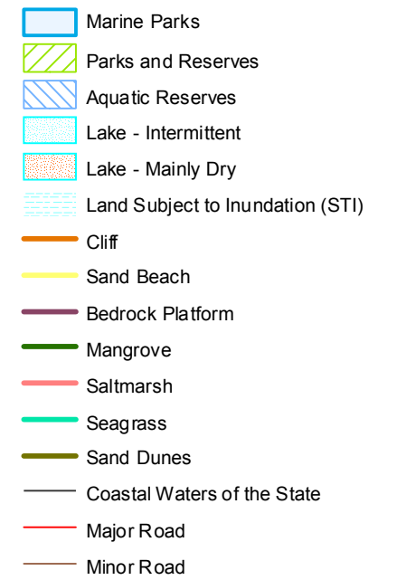
Figure 7: West Coast Bays Marine Park Coastal Shore Types