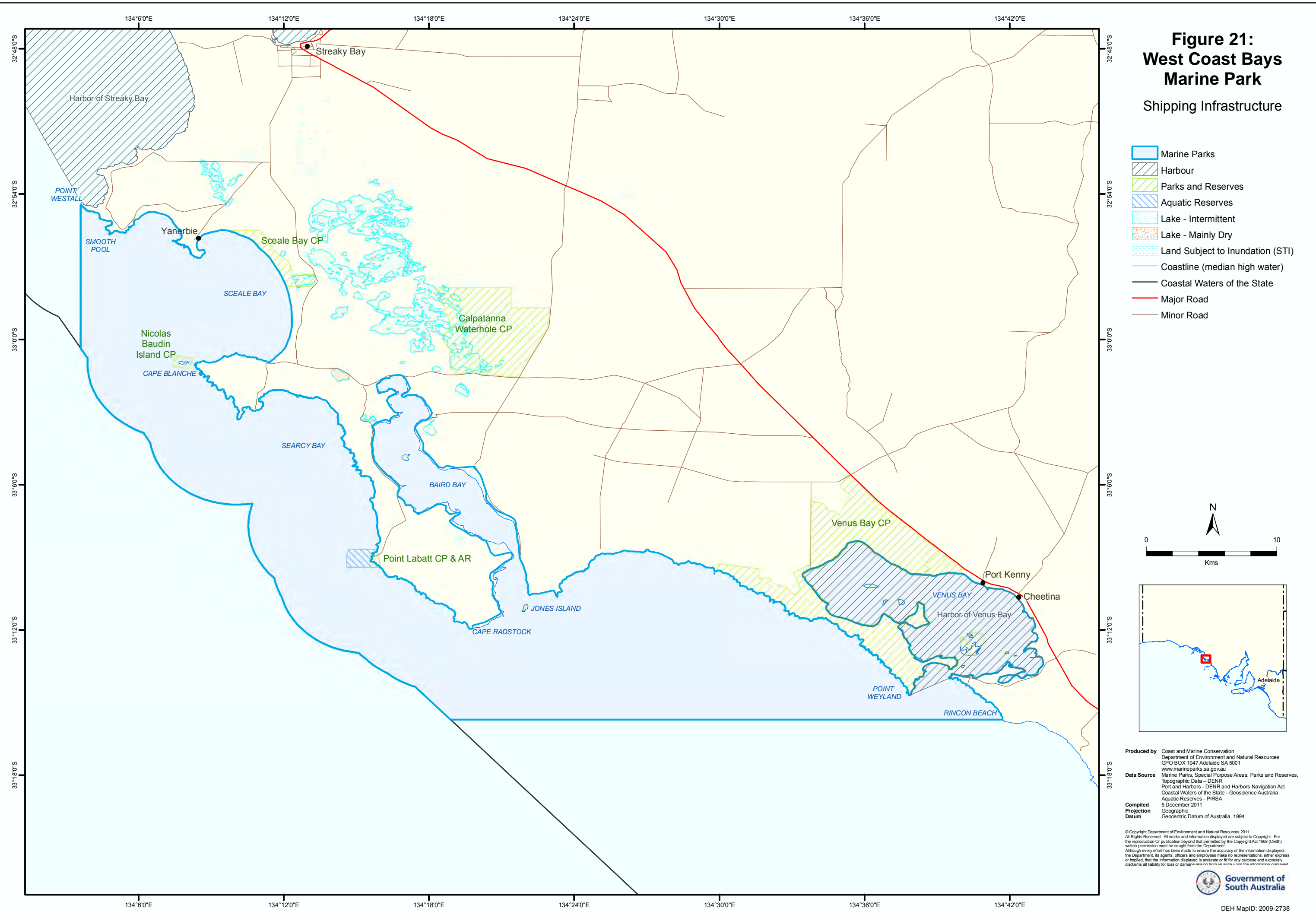
Figure 21: West Coast Bays Marine Park Shipping Infrastructure