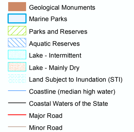
Figure 19: West Coast Bays Marine Park Geological Monuments