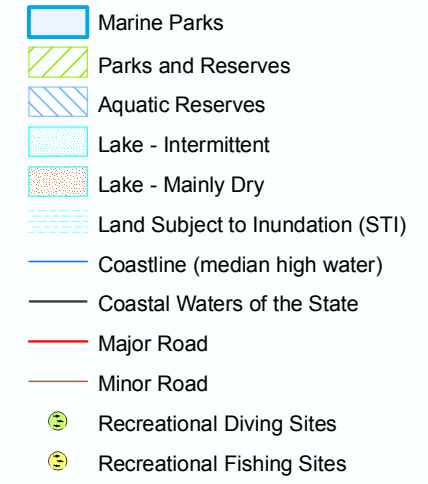
Figure 14: West Coast Bays Marine Park Published Recreational Fishing Sites (1998) and Diving Sites

Pescatore and Ellis 'Country GPS Marks in South Australia', 1998