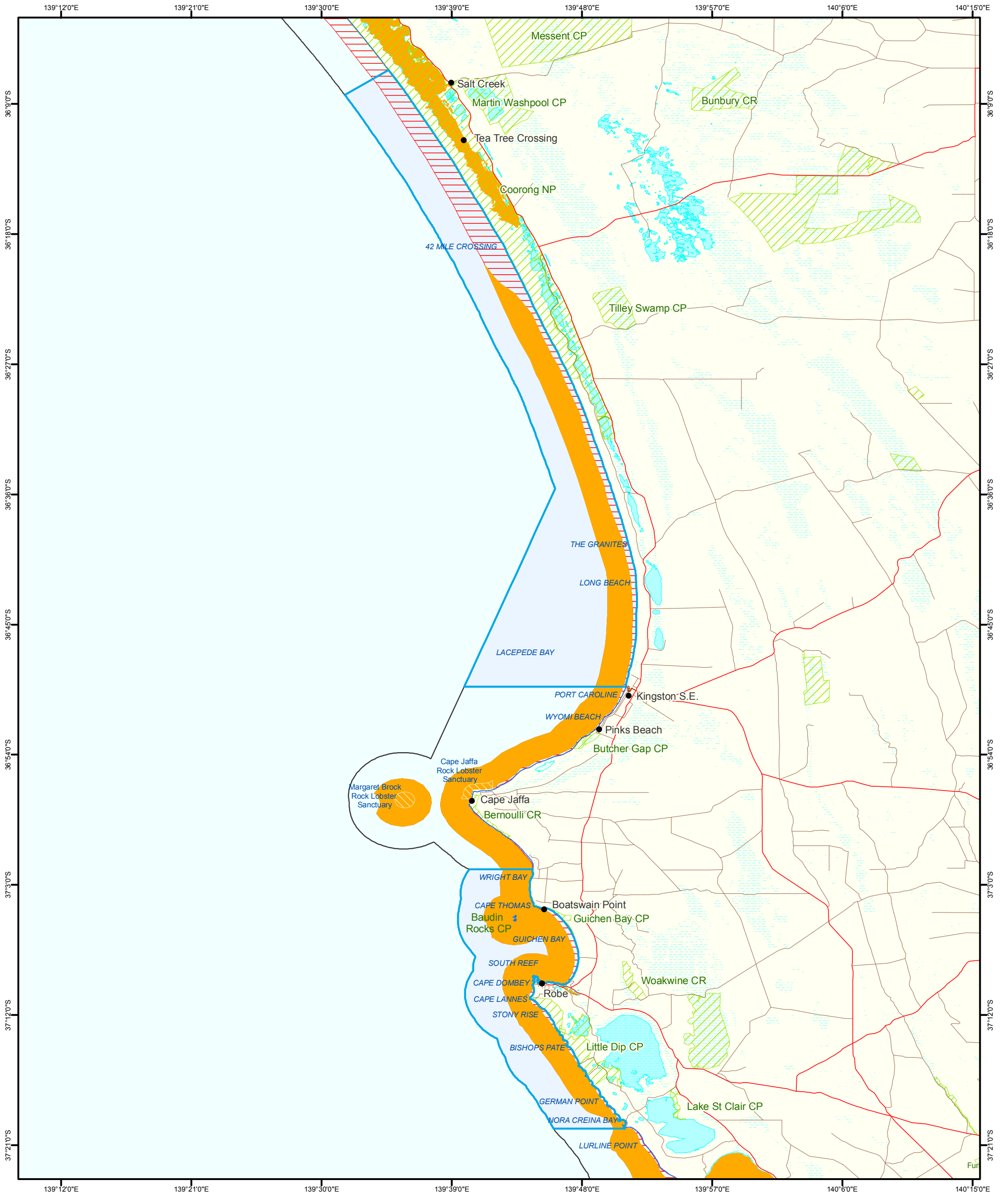
Figure 12A: Upper South East Marine Park Fish Habitat Breeding, Spawning and Nursery for Commercial and Recreational Fisheries