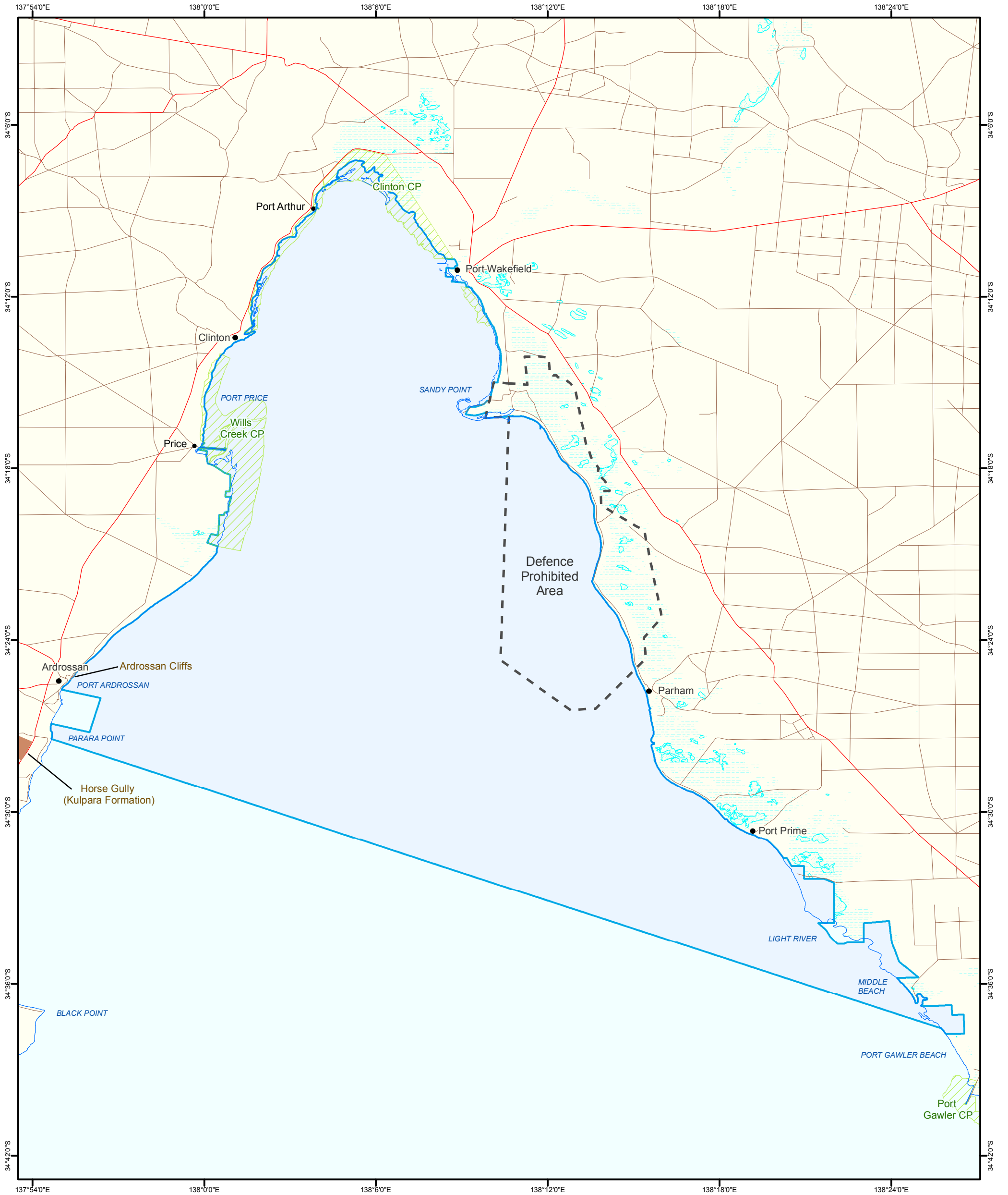
Figure 19: Upper Gulf St Vincent Marine Park Geological Monuments