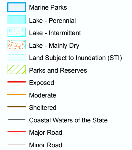
Figure 8: Thorny Passage Marine Park Coastal Exposure