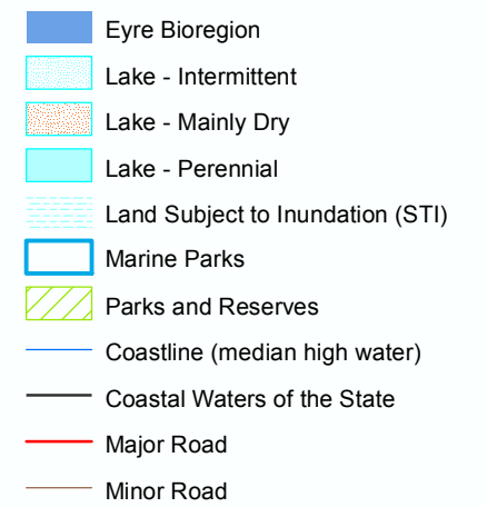
Figure 3: Thorny Passage Marine Park Bioregions