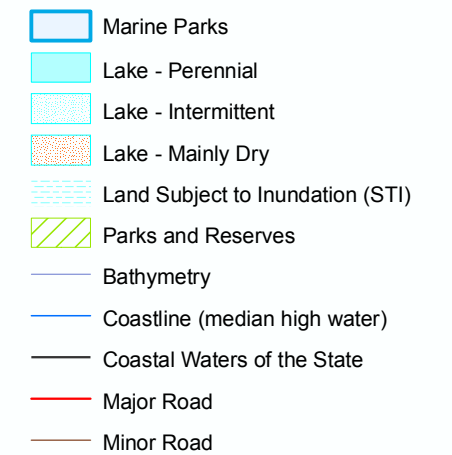
Figure 2A: Thorny Passage Marine Park Bathymetry Contours