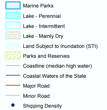
Figure 22: Thorny Passage Marine Park Shipping Density