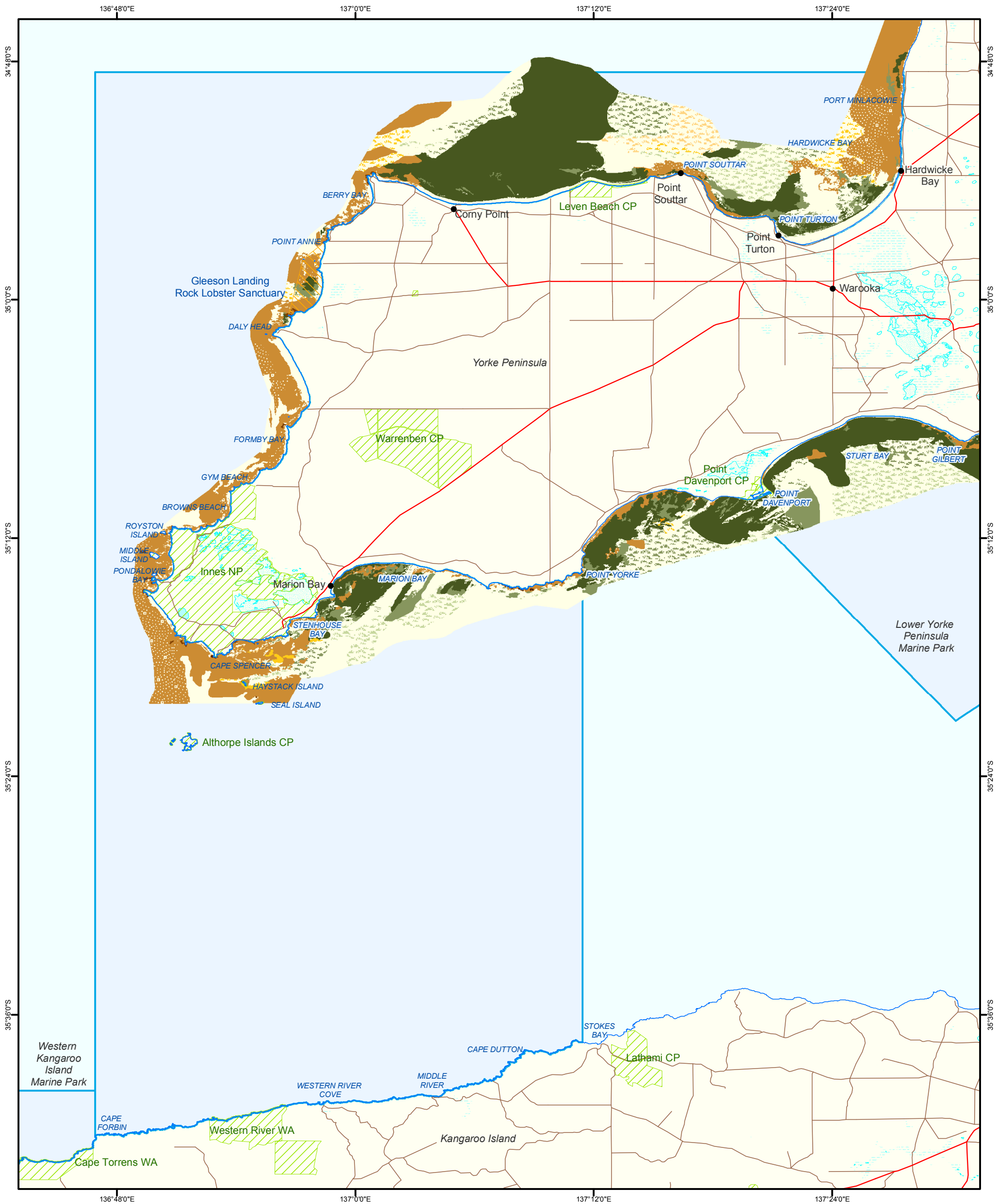
Figure 5B: Southern Spencer Gulf Marine Park State Benthic Habitats