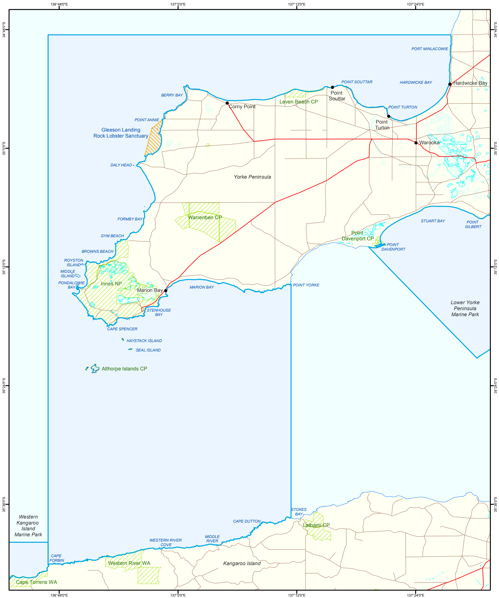
Figure 1: Southern Spencer Gulf Marine Park Boundary Proclaimed July 2009