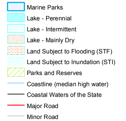
Figure 1: Nuyts Archipelago Marine Park Boundary Proclaimed July 2009