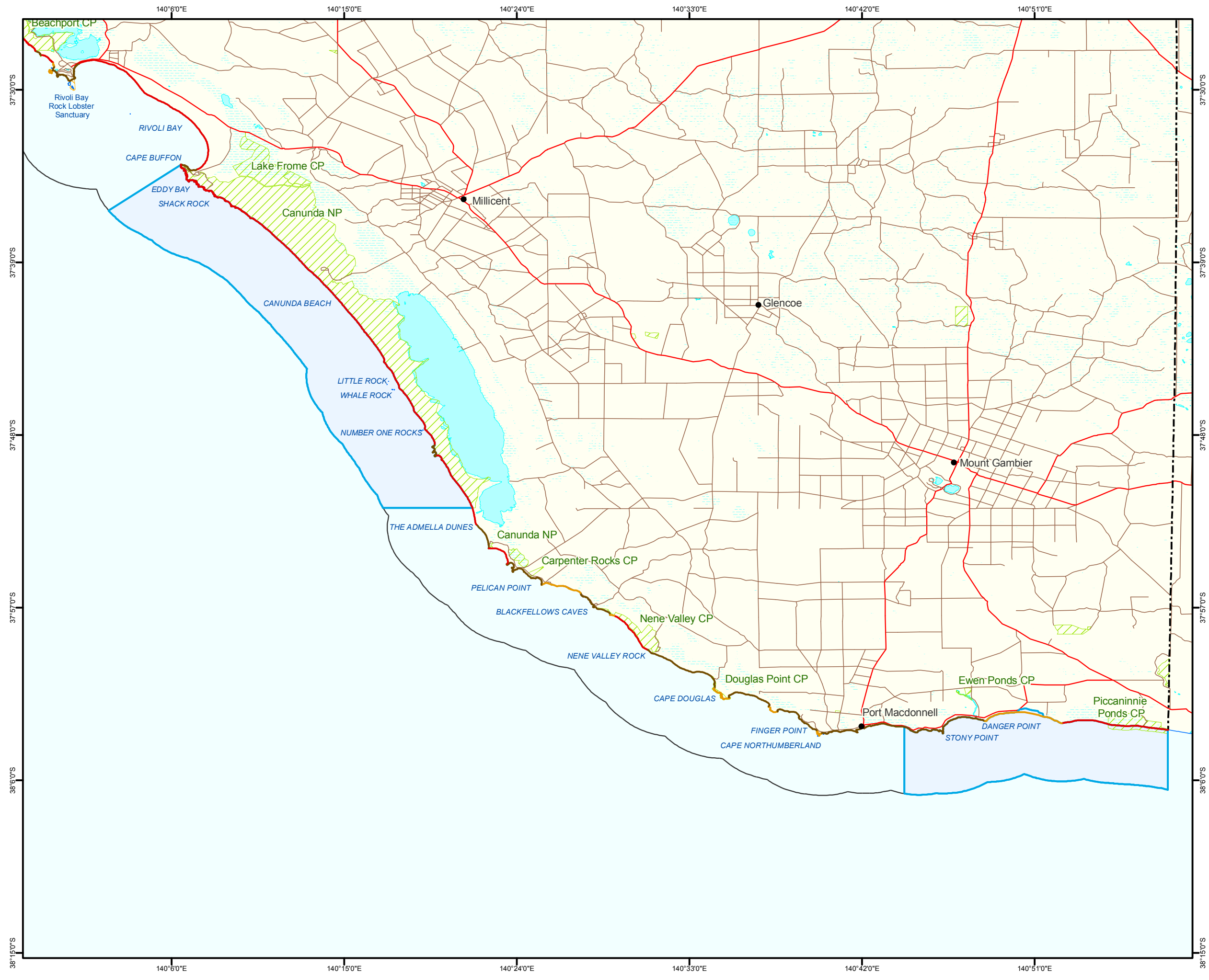
Figure 8: Lower South East Marine Park Coastal Exposure