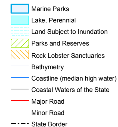
Figure 2A: Lower South East Marine Park Bathymetry Contours