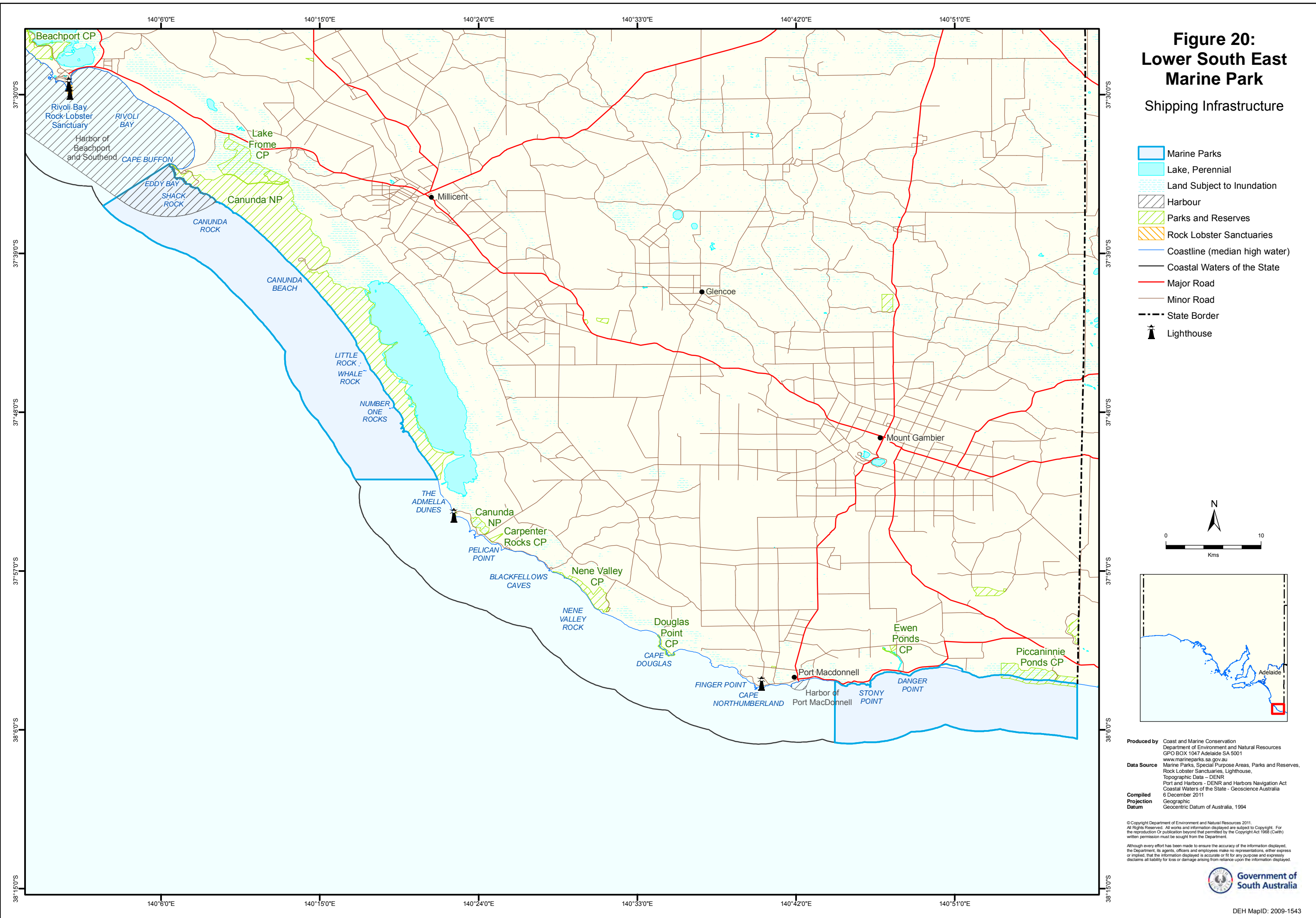
Figure 20: Lower South East Marine Park Shipping Infrastructure