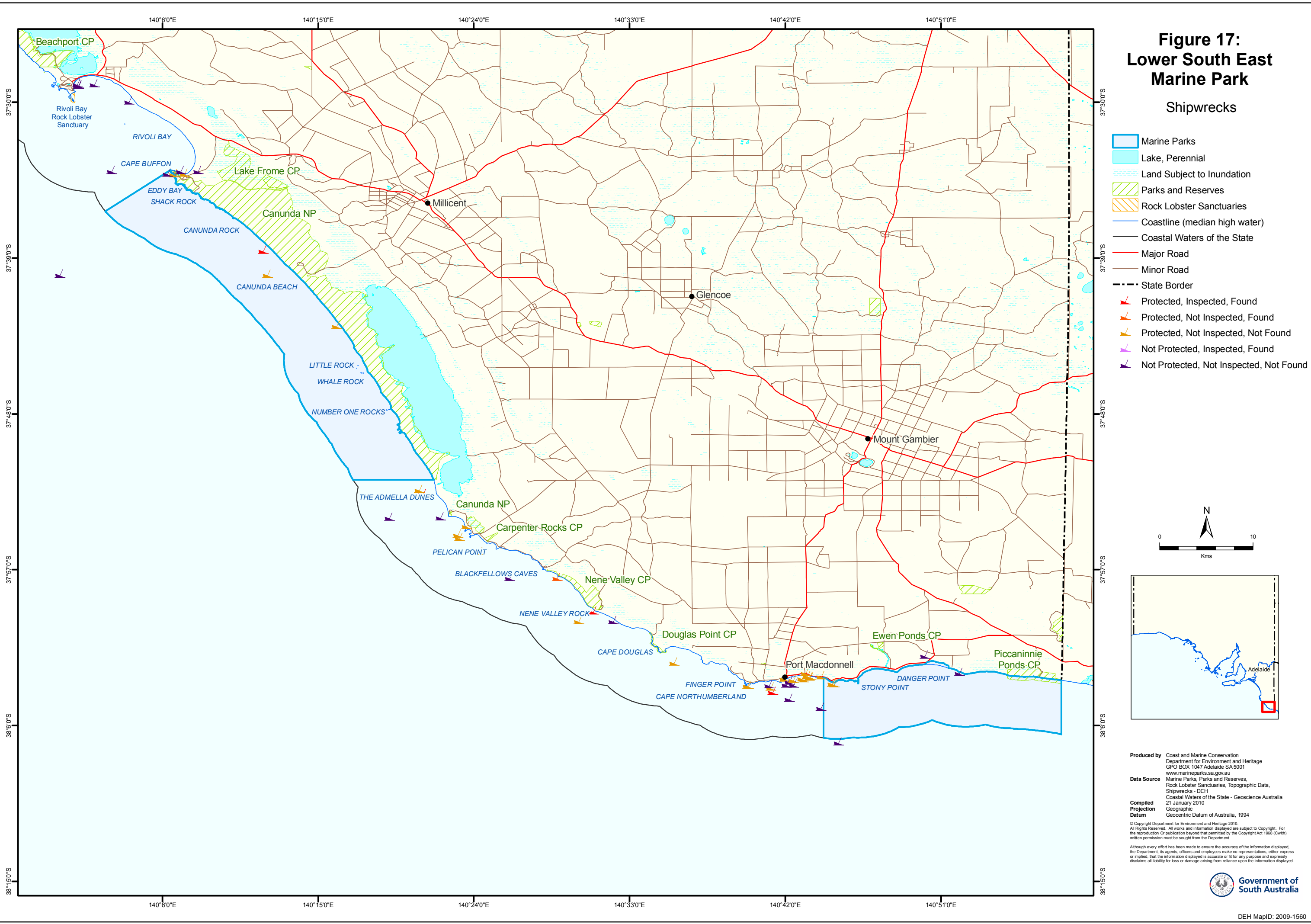
Figure 17: Lower South East Marine Park Shipwrecks