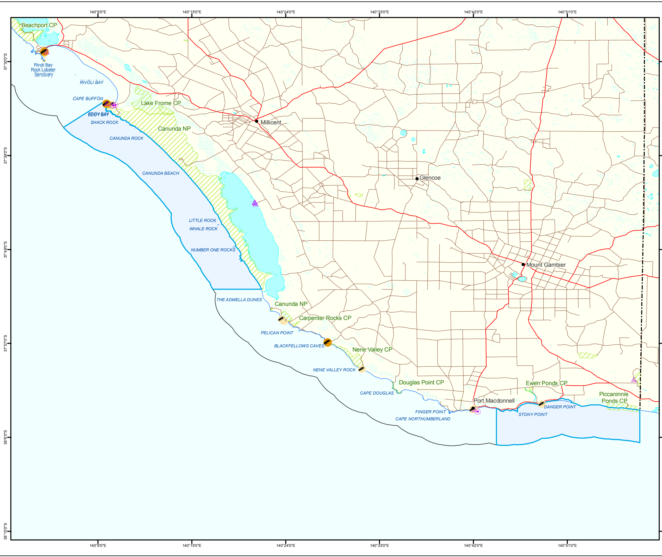
Figure 13: Lower South East Marine Park Boat Ramps, Breakwaters and Jetties