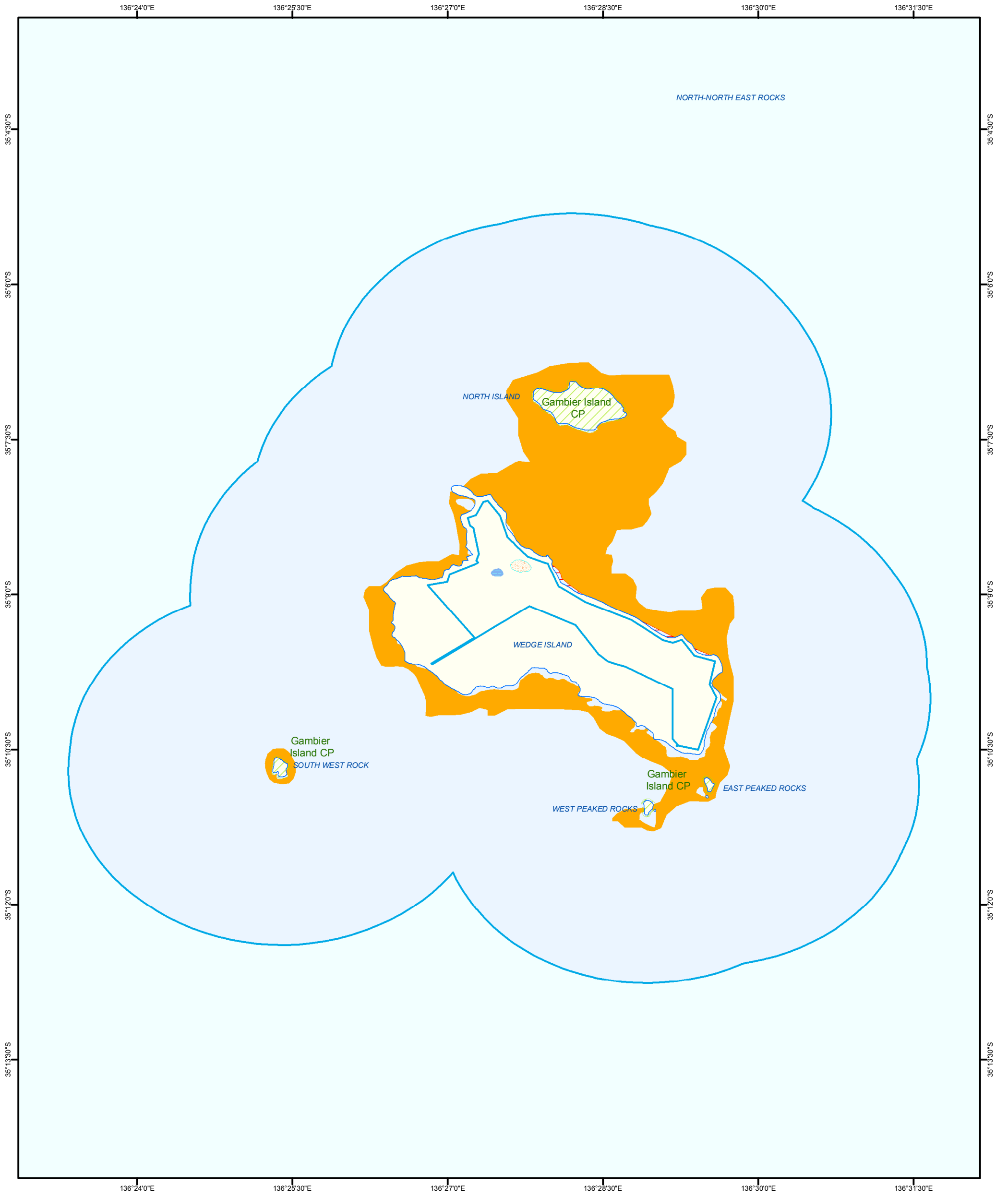
Figure 9A: Gambier Islands Group Marine Park Fish Habitat Breeding, Spawning and Nursery for Commerical and Recreational Fisheries