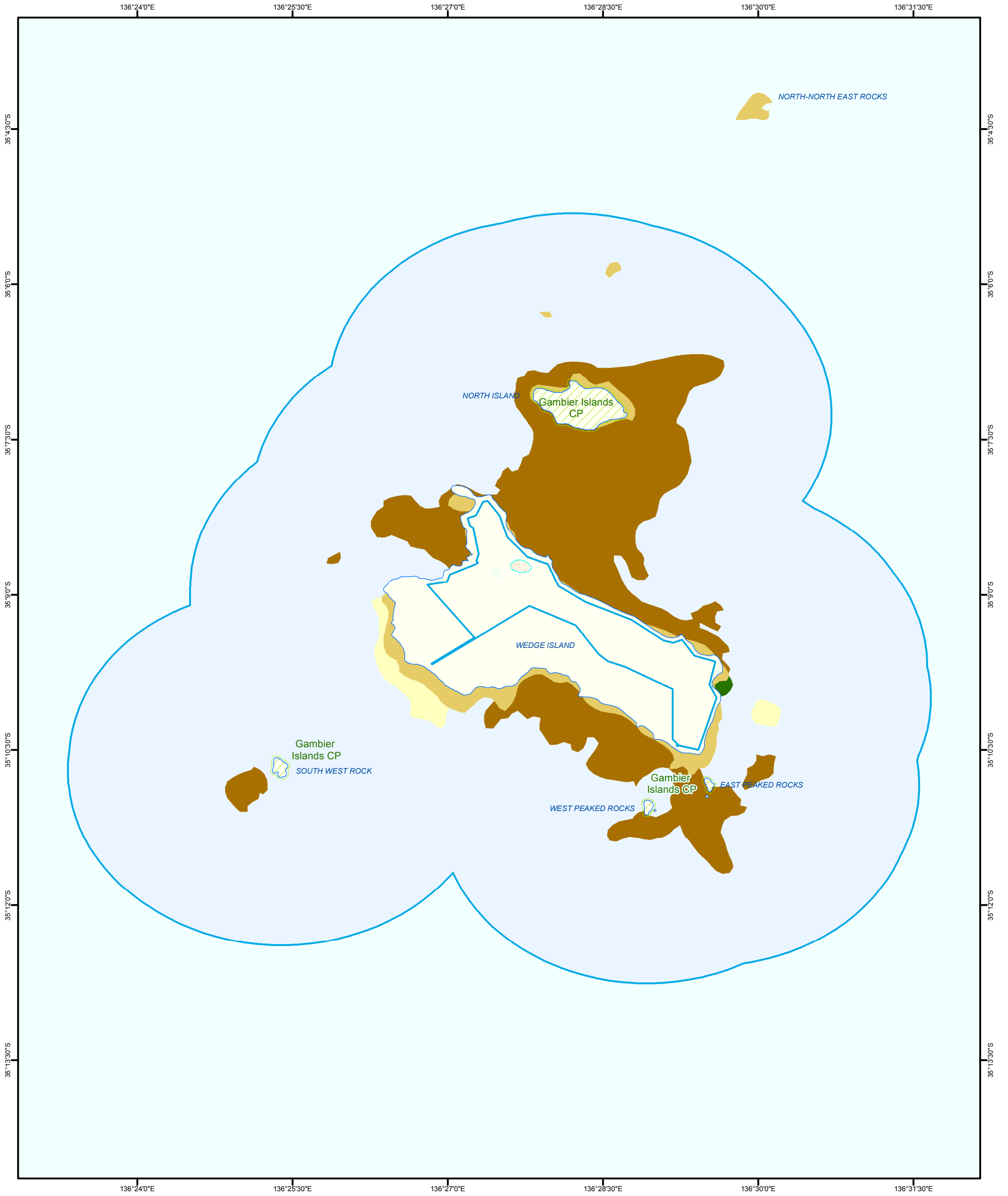
Figure 5: Gambier Islands Group Marine Park National Benthic Habitats