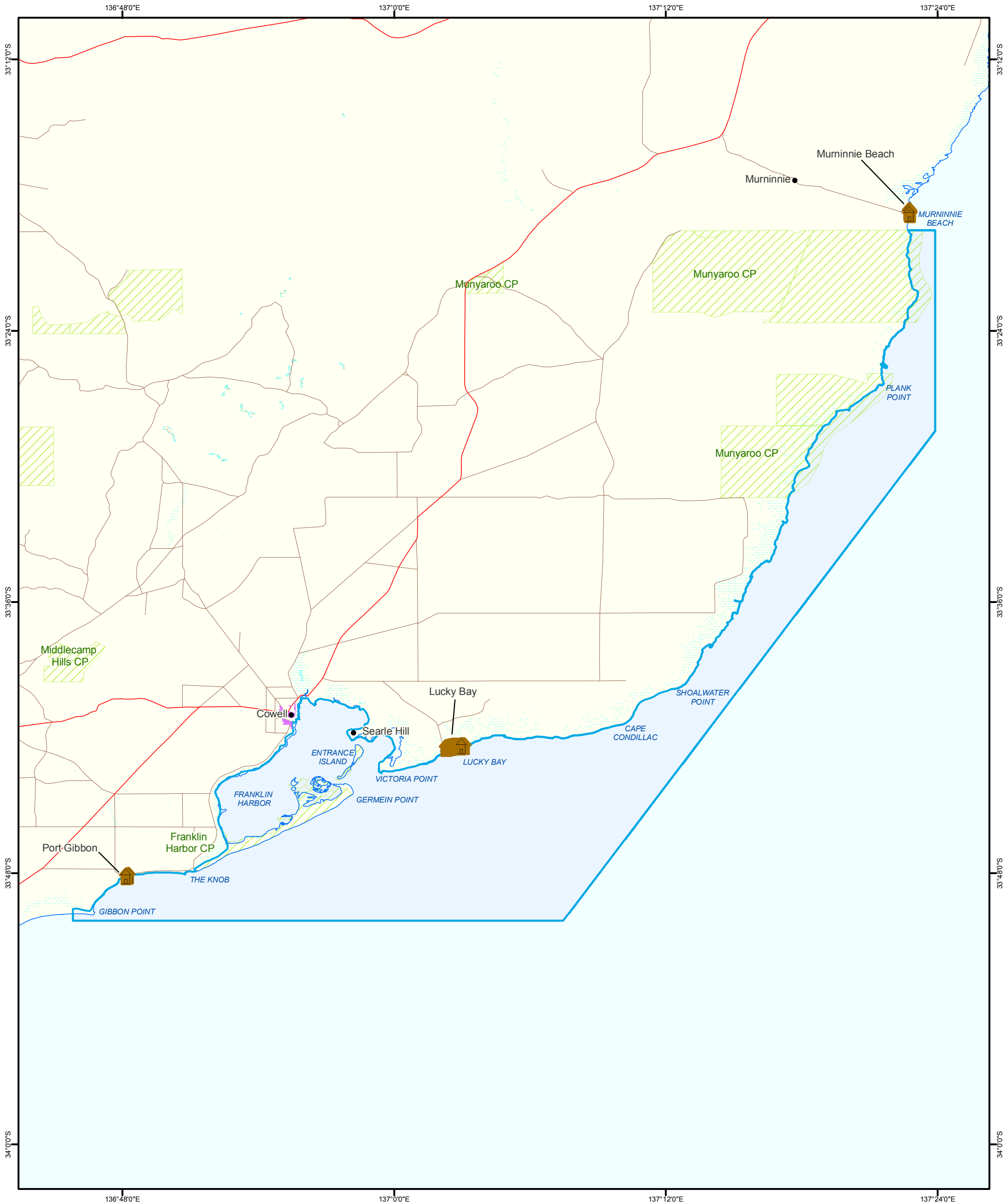
Figure 15: Franklin Harbor Marine Park Built Up Areas and Shacks