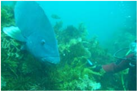
Cape Borda SZ Huge cliffs with wilderness qualities Home to reef fish.. Protects a significant stretch of remote coastal habitats.