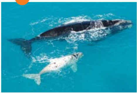
KI Upwelling SZ Habitat area for dolphins and whales. Important site for cold, deep-water upwellings that carry nutrients for sea life.