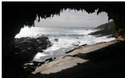
Cape du Couedic SZ and RAZ One of two places in SA where both Australian and NZ fur seals and Australian sea lions can be found in the same place. Coastal rocky reefs and two offshore islands. Admirals Arch a state tourist icon. Rugged, offshore island wilderness areas