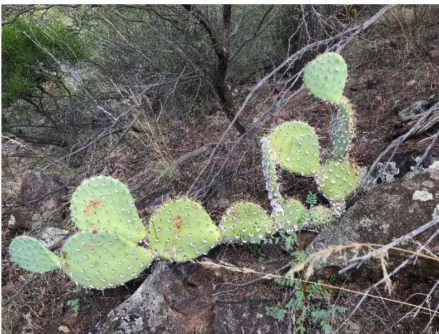
Cochineal working hard on controlling cactus at Warren Gorge