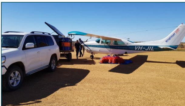
Pictured above - Loading the plane with fresh meat baits at the Blinman airstrip

An aerial wild dog bait was conducted by board staff over 8 days between 14 September and 1 October 2020. The operation deployed 47,695 meat baits over 9,539 km of bait lines (an average of 5 baits per km) on 88 pastoral properties. The actual total distance flown was 12,415 km. PIRSA has also undertaken additional aerial baiting services recently alongside the board's Biteback Program.