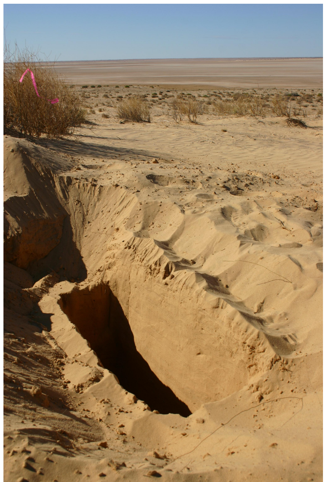
Figure 3. A Marsupial Mole survey trench at site MM004, overlooking Lake Florence.