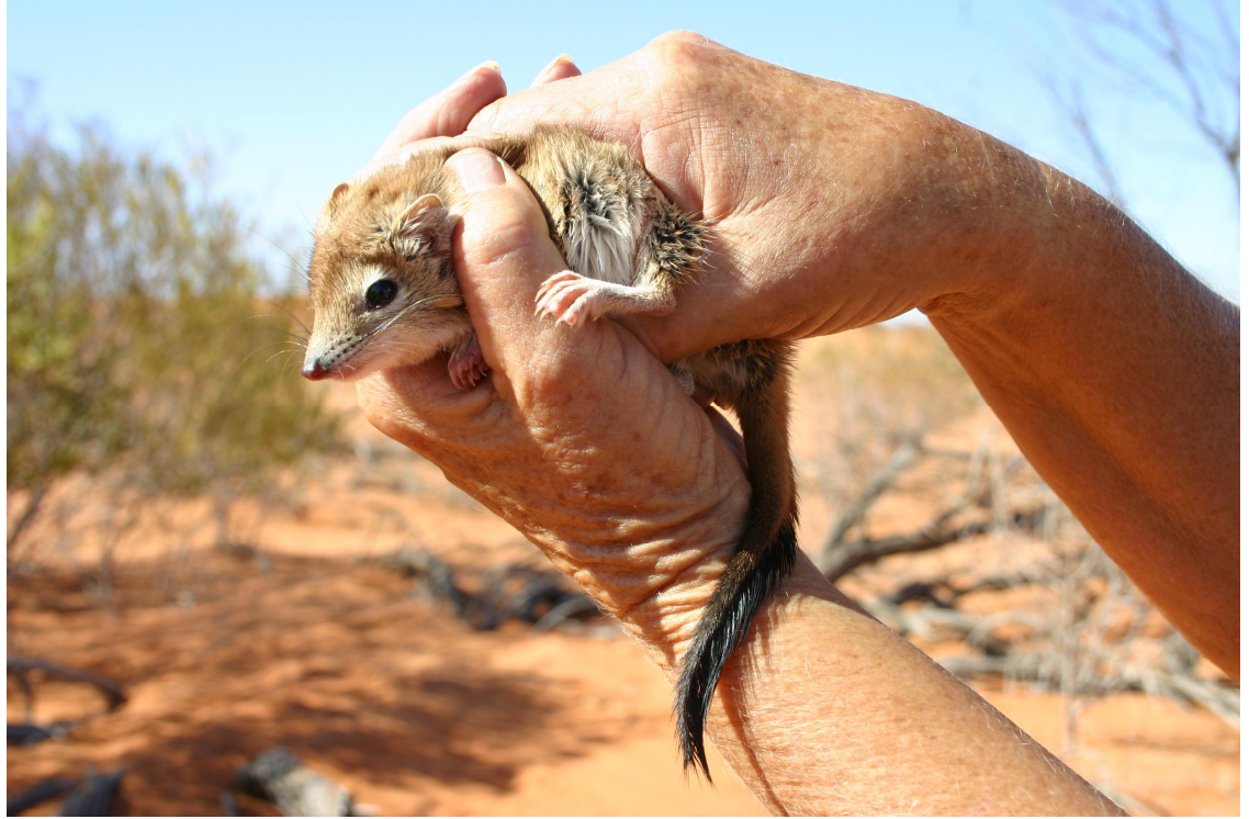
Figure 5. An adult male Ampurta. This animal was caught in the Simpson Desert Regional Reserve.