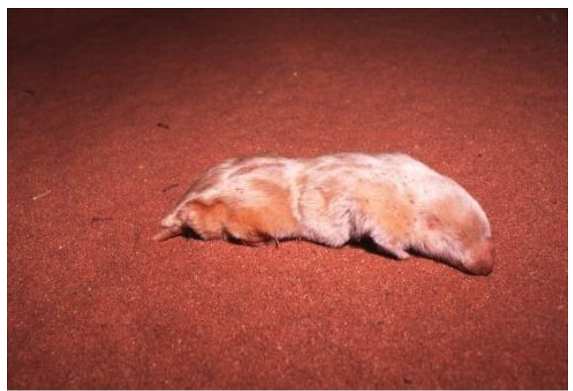
Figure 8. A Marsupial Mole. The legs and feet of these animals are well-adapted to swimming through sand and are of little use above the surface. They are unable to move very quickly at all on the sand surface and are more likely to vanish into the sand by burying themselves if disturbed rather than running away.