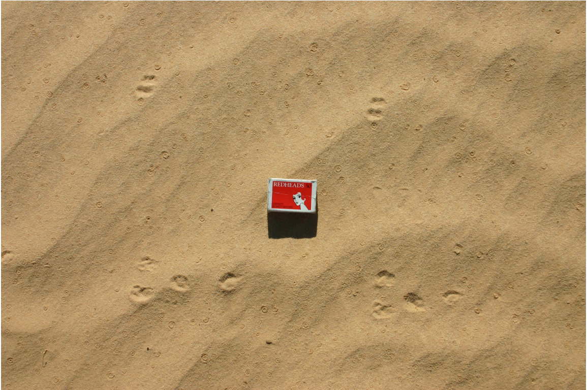
Figure 4. Tracks made by a Hopping Mouse (top) and Ampurta (bottom) at site MM004. Ampurtas use the same gait as a rabbit, but their tracks are distinguished by their smaller size and more obvious toe marks (matchbox for scale).