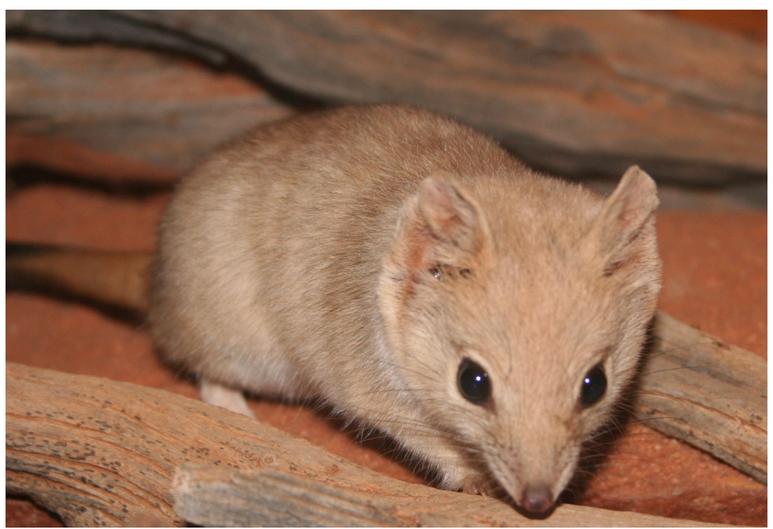
Figure 7. A pale male Ampurta. This captive animal was originally caught to the west of Lake Eyre on The Peake Station. Fur colour can be quite variable and is usually darker in areas with deep red sand, grading to a golden blonde colour in areas of pale sand.