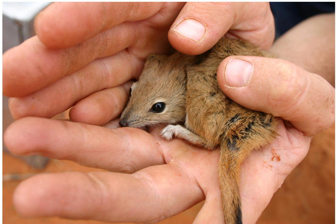
Figure 6. A much smaller female Ampurta, also caught in the Simpson Desert Regional Reserve.