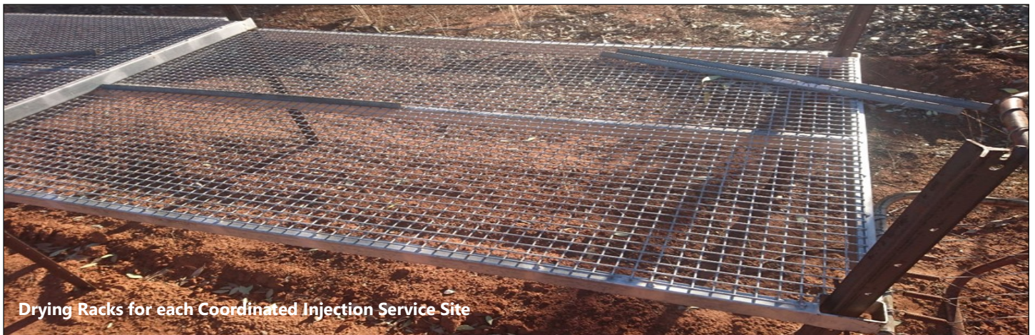
Drying Racks for each Coordinated Injection Service Site

Some extra days have been added for the district to accommodate for an expected increase in participation by land managers meeting the baiting levels outlined in the Best Practice Guidelines for Wild Dog Control .