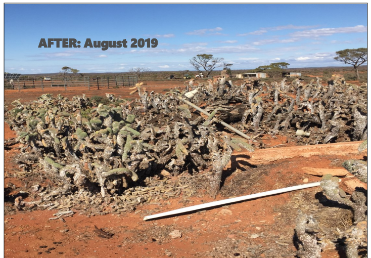
AFTER: August 2019

ABOVE: Cochineal has been used on a cactus infestation in the north western Gawler Ranges with great success. These pictures taken in November 2017 (left) and August 2019 (right) show the extent of the infestation.