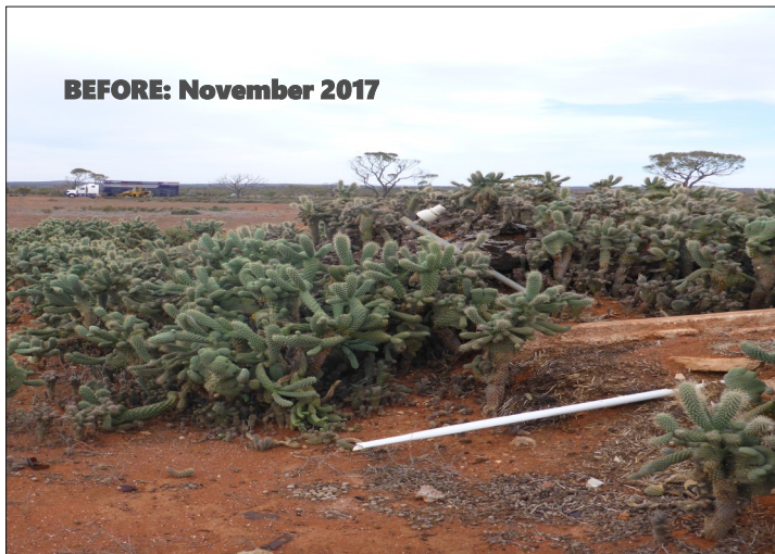
BEFORE: November 2017

Welcome to our first edition! Twice each year the Gawler Ranges NRM Group plans to update you on its activities, as well as the SA Arid Lands NRM Board's news and work in the Gawler Ranges district.