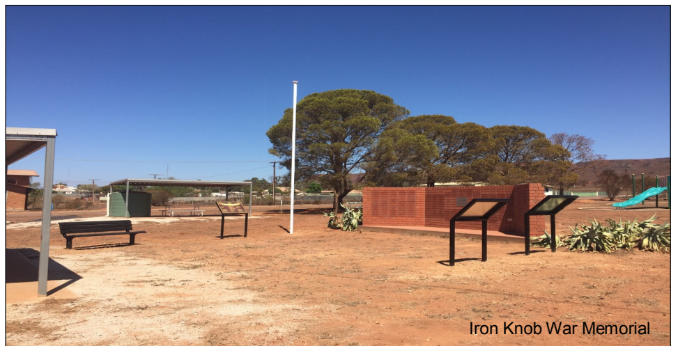
Iron Knob War Memorial

Progress Associations and sporting groups are currently looking at possible projects