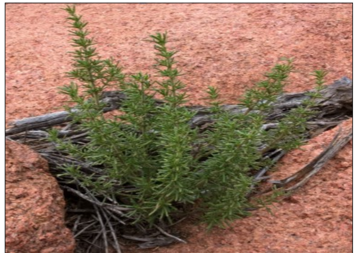
ABOVE: The rare Gawler Ranges Mintbush.

The students observed the changes in the landscape as they climbed the hill and the effects of herbivore grazing on plant species.