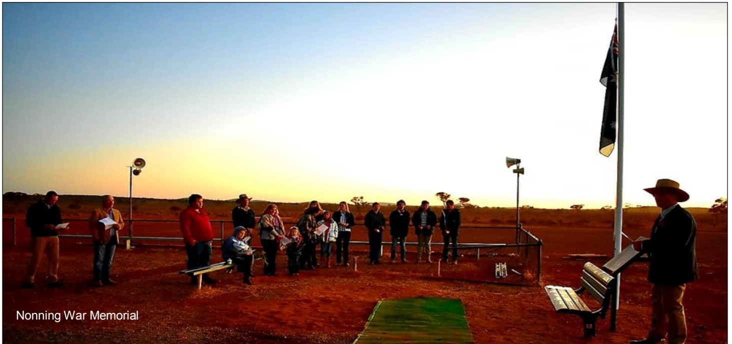
Nonning War Memorial