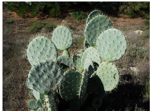
Wheel cactus pads