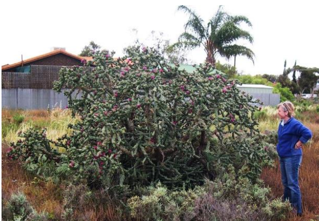
Mature Devil's rope cactus

Usually 1-2 m high and occasionally up to 3 m, often with a woody trunk. The plant is made up of strong woody segments dark to grey-green which are rope like in appearance. Sharp spines (2-30) emerge from depressions in segments, spines, 2-3 cm long, enclosed in yellow bristles. Flowers are 3-7.5 cm wide, purple or purplish-red, in late spring to summer. The fruit is usually spineless, barrel shaped and matures to a yellow colour. Originally from southern USA and Mexico, it is unknown when it was introduced but used as an ornamental garden plant.