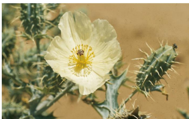
Seed pod and flower

Stiff bluish-green prickly plant that grows up to 1 m in height. Leaves up to 20cm long, silvery green with white veining and deep regular lobes. The upper surface of the leaf is smooth while the underside has a few prickles along the midrib. The stem leaves, in contrast to the rosette leaves, are stalkless and clasp onto the plant's stem. Flowers 6 cm in diameter with four light yellow or cream petals, flowering generally November to February but is opportunistic in arid areas and can flower whenever moisture is available. Fruit spiny, oblong seed capsules, 3.5cm in length with three to six openings at the top. The capsule contains up to 400 seeds. Seeds are oval-shaped, blackish brown, about 1.5 mm long with a pitted seed coat and a ridge along one side. Originally from Mexico, Central America and USA, it was first reported near Sydney in 1845, probably imported as a contaminant of wheat seed. Argemone ochroleuca is similar in appearance and far more widespread than A. mexicana , and both species are referred to as Mexican poppy. A. mexicana differs from A. ochroleuca in that it has bright yellow flowers as opposed to cream or pale-yellow flowers, and globular flower buds as opposed to the egg-shaped buds of A. ochroleuca .