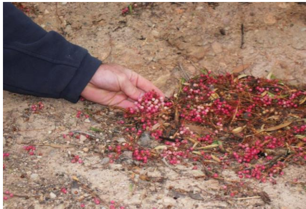
Mature fruit