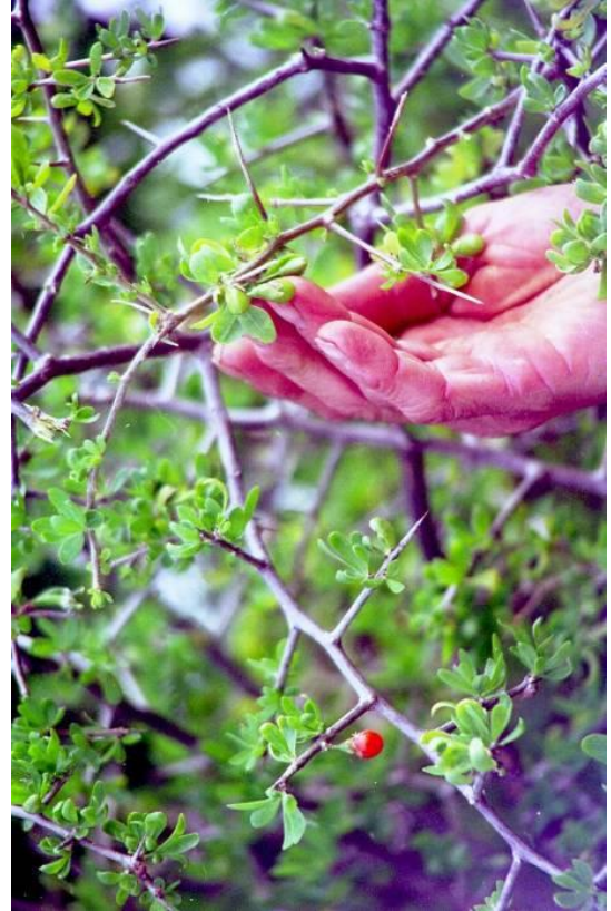
Immature and mature fruit