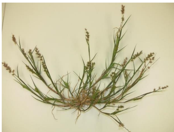
Innocent weed plant (Credit: A Harvey)

Cenchrus longispinus and Cenchrus incertus can be confused with each other and other Cenchrus sp. Species are distinguished by their 'burrs'.