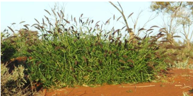
Buffel grass plant