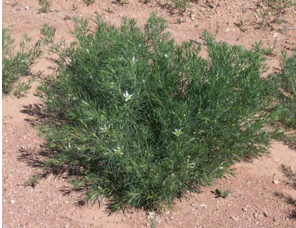
African rue plant (Credit: B Shepherd)

Perennial herb or shrubby plant 30-80 cm high. Leaves 1-5 cm long, bright green, divided several times into three or more linear segments. Flowers with five white broad petals, 12-17 mm long, in late spring to early summer. Fruit is slightly flattened capsule, 8-12 mm across and 7-12 mm long, which opens at the top, containing black angular seeds. Originally from the Mediterranean region and the Middle East, introduced in the 1930s for unknown reasons. It is considered to be an aphrodisiac in India, and its seeds and leaves have been used traditionally to treat various ailments including asthma, jaundice, colic and as a diuretic.