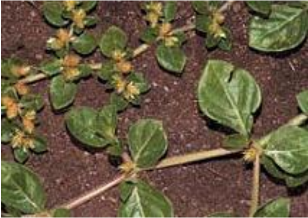
Khaki weed runners

Khaki weed may be confused with other species. For more information click here .