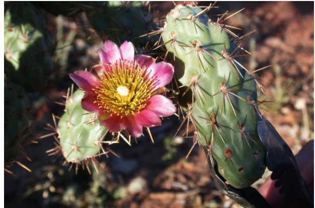
Jumping cholla flower