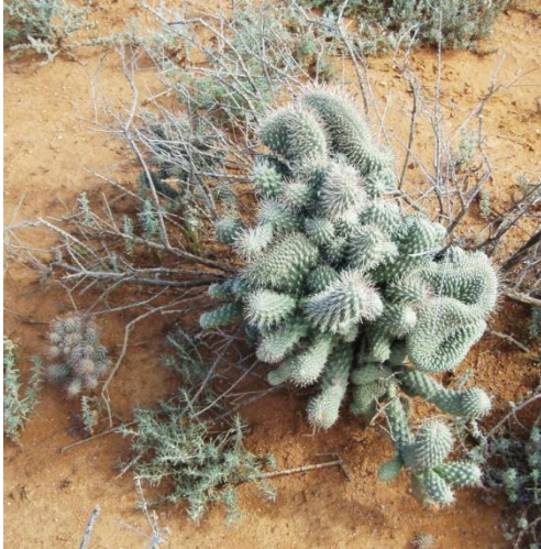
Coral cactus plant

Usually 1-1.5 m high and occasionally up to 3 m. Upper segments are smooth greyish to dark green, 6-70 cm long and 1-5 cm wide. Segments resemble coral as they mature. Spines (1-6) emerge from depressions, with white woolly hairs and minute bristles. Flowers dull red 2-3.5 cm wide, in late spring to summer. Fruit is yellow-green, spiny, barrel shaped. Originally from Ecuador and Peru, it is unknown when or why it was introduced. Floodwaters may damage plants and also disperse segments resulting in new infestations.