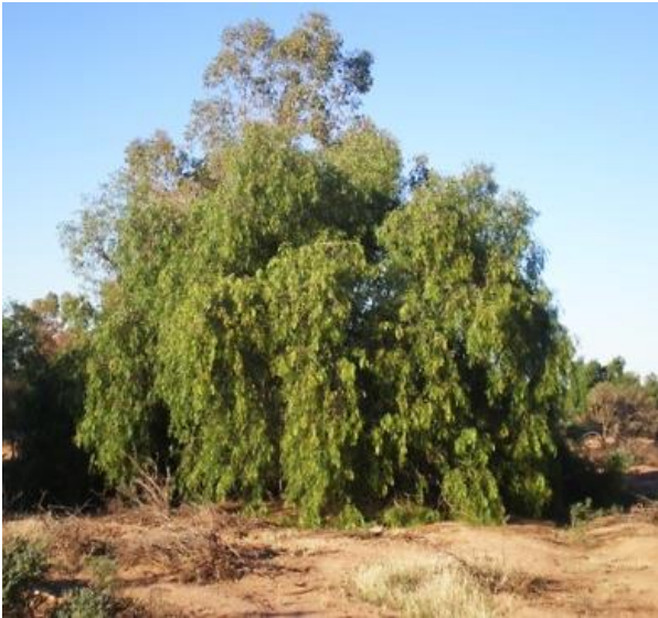
Mature Pepper tree

A large evergreen tree to 12 m tall and 5-10 m wide. Leaves are divided into 15-41 alternatively arranged, shiny leaflets, 4 cm long. Leaves are aromatic and sticky when crushed. Small white flowers hang in long sprays, all year round, and are followed by spherical shiny pink fruit, 4-6 mm in diameter. Originally from South America, it was introduced in 1870s as a shade tree. All Schinus species leaves and fruit are poisonous to livestock and possibly humans.