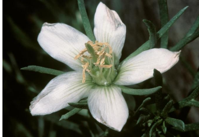
African rue flowers