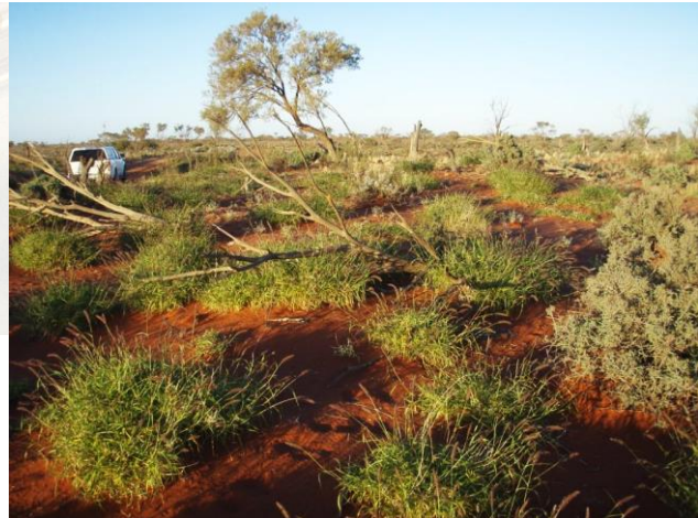
Buffel grass infestation