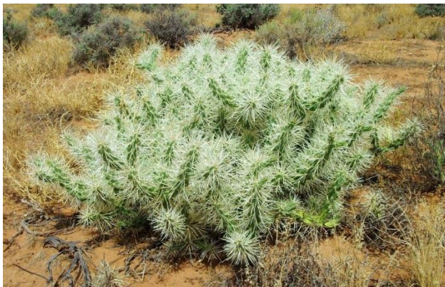
Mature Hudson pear cactus

Branched, 1.5 m high to 3 m wide. Segments are cylindrical up to 90 cm long and 4 cm wide. Segment depressions contain clusters of 4-8 spines, up to 3.5 cm long. Pink flowers to 5 cm wide, late spring and summer. Fruit is wider towards the tip, 2 - 4.5 cm long. Originally from Mexico and introduced in 1960s as an ornamental garden plant.