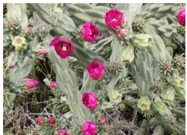
Devil's rope flower