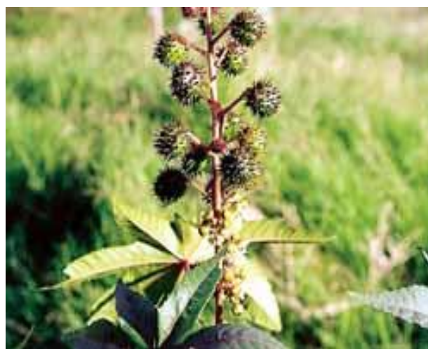
Castor Oil Plant with fruit