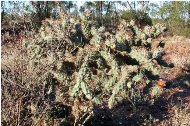
Jumping cholla plant

Up to 2m high. Segments are grey-green up to 15 cm long and 5 cm wide. Segment depressions contain 6-12 spines up to 2 cm long. Flowers rose to magenta, to 4 cm wide, spring to early summer. Fruit 2-4 cm long, 2-3 cm wide, spineless occasionally in short chains. Originally from USA and Mexico, first record in NSW in 1993, unknown why introduced.