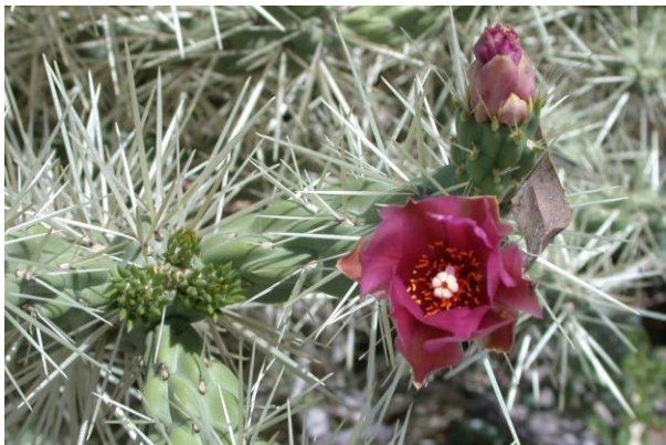
Hudson pear flower