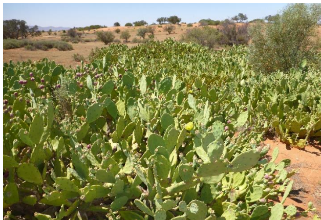
Prickly pear plant

Usually 0.5-1m tall, and 0.5-5m across. The basal stem segments often thicken and form a trunk. The upper stem segments are dull mid to grey-green and oval shaped. Segment depressions are usually spineless or contain 1-11 spines, 1-6 cm long, with brownish woolly hairs and short yellow bristles. Flowers are yellow, 5-8 cm wide, summer. Fruit is pear shaped, smooth and purple at maturity. Originally from drier tropical and sub-tropical America, introduced before 1839 as an ornamental garden plant and for use as food for cochineal insects used to produce dye for soldiers' coats. Plants may still establish from segments following disposal of garden waste unless buried to a depth greater than 1 metre.