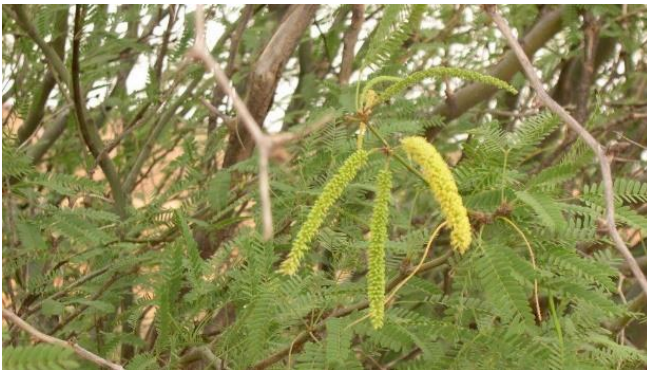
Mesquite flowers