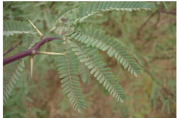
Mesquite leaves and thorns (Credit: B Shepherd)