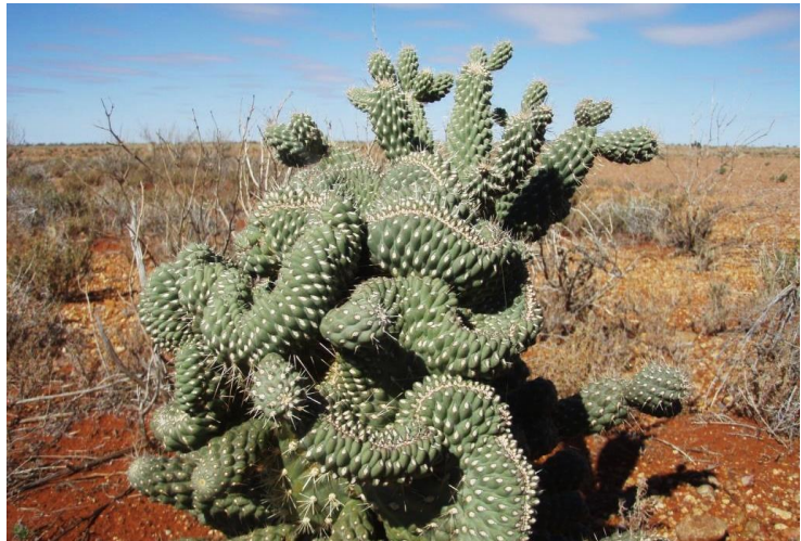
Mature Coral cactus plant