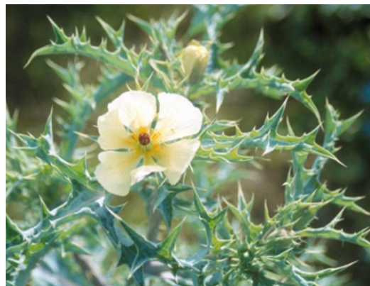
Flower and spiny leaves (Credit: DAFF)