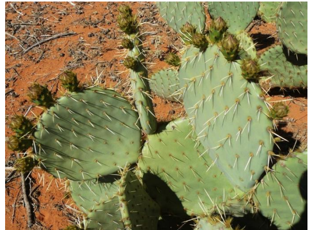
Pads and flower buds