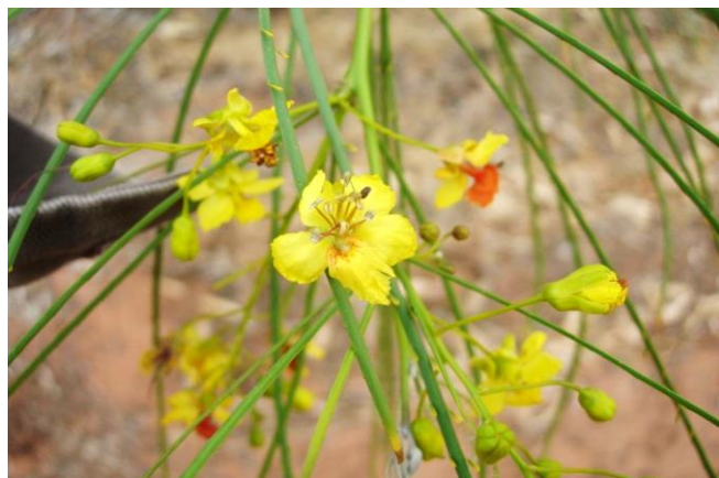
Parkinsonia flowers