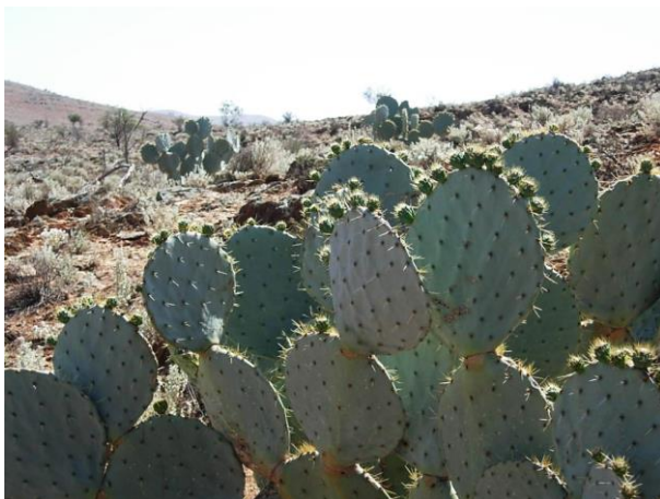
Wheel cactus plants with flower buds

Usually 1-2 m tall, occasionally to 4 m generally with a well-developed trunk. Segments are circular, bluish green to bluish grey to 40 cm in diameter. Segment depressions are widely spaced containing 1-12 spines, 5 cm long with brown woolly hairs and yellow to brown bristles. Flowers are yellow ageing to white, 5-8cm diameter. Fruit is pink to purple, barrel shaped to 8 cm long and 6 cm wide. Originally from Mexico, unknown when introduced but used as an ornamental garden plant. Wheel cactus is considered rare and endangered in its native habitat and is listed on the Convention on International Trade in Endangered Species of Wild Fauna and Flora (CITES).