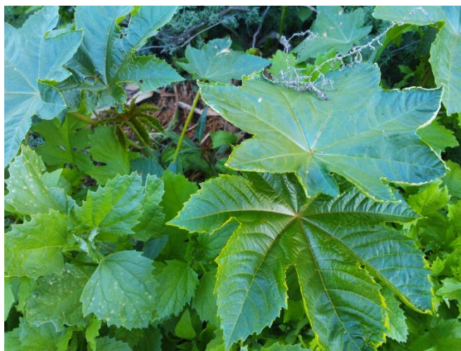
Castor Oil Plant

Tall, branching perennial shrub which grows to 3 m high and occasionally higher. It has stout hollow branches which are a dull pale green or red, older branches and trunks turn greyish. Large leaves (10–60 cm across) are widely spaced on the branches. Each leaf is divided into 7–9 pointed triangular segments with toothed edges and conspicuous veins. Leaves are glossy, dark reddish-green when young, glossy green when mature. Flowers are crowded in stout, erect spikes in the forks of the upper branches, from summer to autumn. Female flowers are in the upper part of the spikes, male flowers at the base. Female flowers develop into fruits about 2.5 cm across which are covered with soft green or red spines. These fruits have three segments, each segment containing one large, mottled, smooth seed. When ripe, the fruits explode violently and throw the seeds a distance of several metres. Originally from Africa and Eurasia it was first recorded in Australia in 1803 and was introduced as an ornamental for gardens. The seed contains ricin and is poisonous to stock and people. The sap can cause temporary blindness if exposed to eyes.