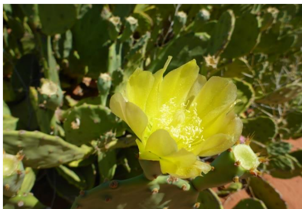
Prickly pear flower