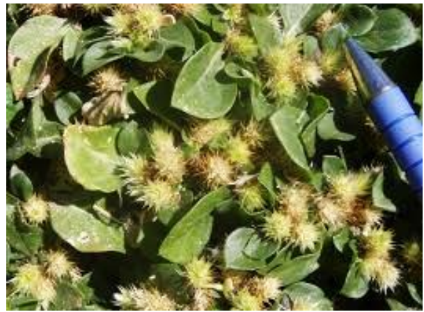
Khaki weed burrs