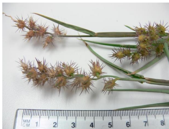
Innocent weed seed heads