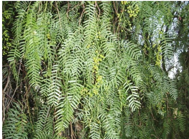
Immature fruit