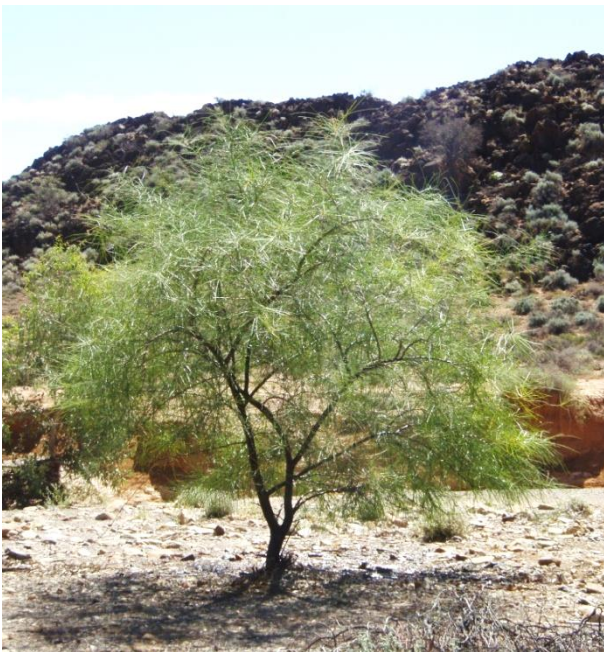
Parkinsonia tree

Do not confuse Mesquite with prickly acacia trees. For more information click here .