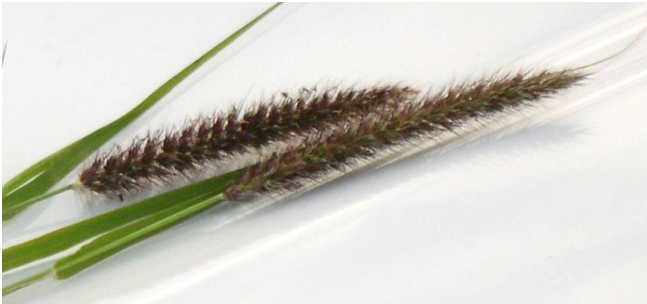
Buffel grass seed head

Buffel grass may be confused with other grass species. For more information about telling the difference please click here .