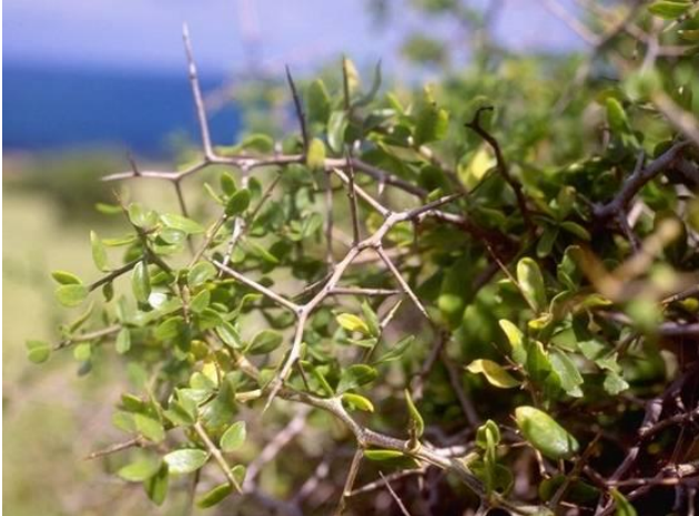
Leaves and spines

Do not confuse African boxthorn ( Lycium ferocissimum ) with the native Australian boxthorn ( Lycium australe ) .