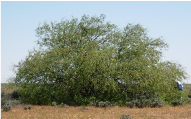
Mature Mesquite tree

Do not confuse Mesquite with prickly acacia trees. For more information click here .