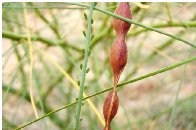
Parkinsonia seed pods