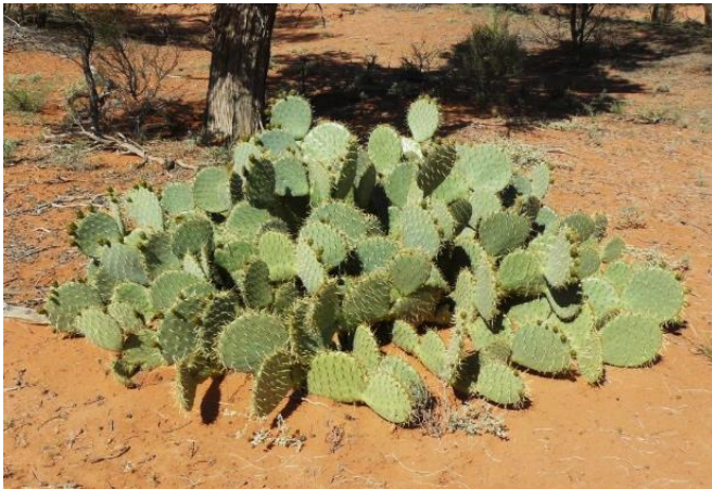
Mature Engelmann's prickly pear

Up to 2m tall. Upper segments are dull mid to grey-green and oval to circular shaped, 9-26 cm long. Segment depressions contain 1-12 spines, with brown woolly hairs and short yellow-brown bristles. Yellow flowers. Fruit is pear to barrel shaped, spiny, and matures to reddish-purple. Originally from USA and Mexico, unknown when and why introduced.