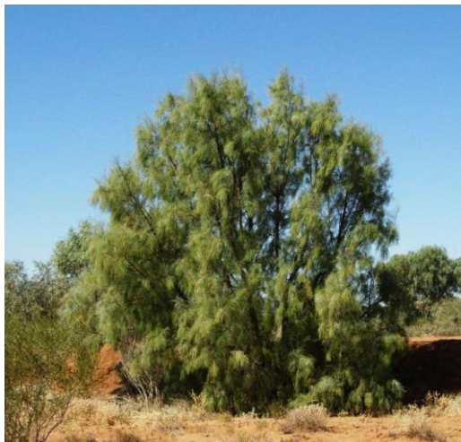
Mature Athel pine

Tree to 15 m high, with branchlets which appear jointed but are small leaves, 1-2 mm long, surrounding the stem. Flowers are pink-white, summer. Produces bell shaped fruit containing numerous seeds. Originally from Mediterranean region, north Africa and India. Athel pine was introduced in the 1930-1940s to arid and semi-arid areas for shade, shelter and erosion control. Tamarisk or Salt Cedar ( Tamarix ramosissima ), is similar to Athel pine and has also shown weedy tendencies in SA, NSW and WA.