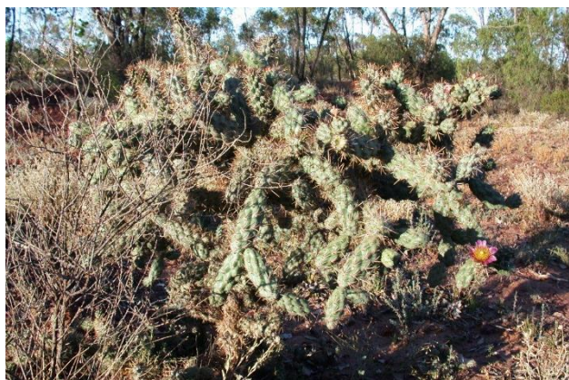
Jumping Cholla plant

Up to 2m high. Segments are grey-green up to 15 cm long and 5 cm wide. Segment depressions contain 6-12 spines up to 2 cm long. Flowers rose to magenta, to 4 cm wide, spring to early summer. Fruit 2–4 cm long, 2–3 cm wide, spineless occasionally in short chains. Originally from USA and Mexico, first record in NSW in 1993, unknown why introduced.