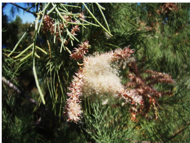
Pink-white flowers