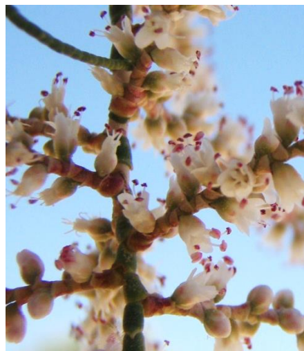
Athel pine flowers