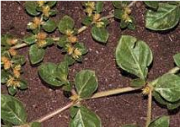
Khaki weed runners

Khaki weed may be confused with other species. For more information click here .