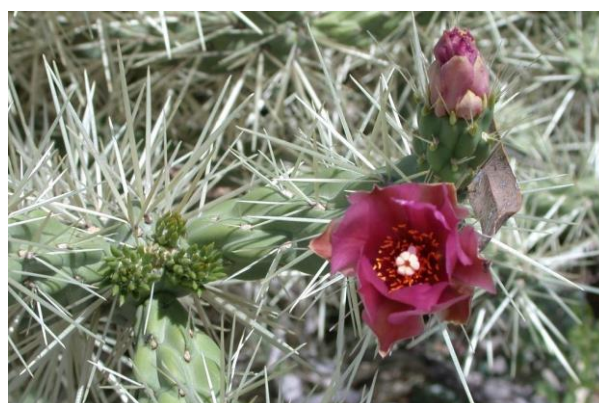
Hudson Pear flower