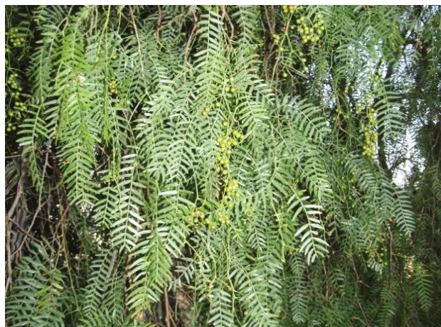
Immature fruit