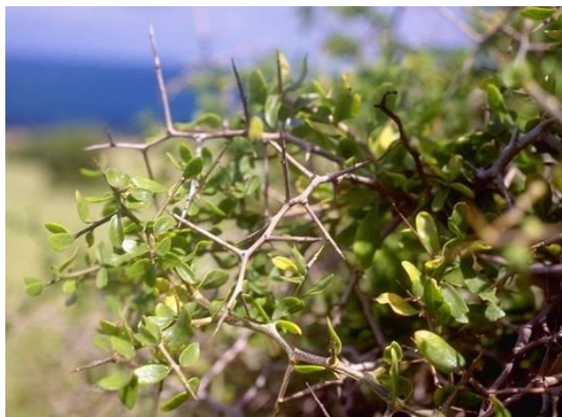
Leaves and spines

Do not confuse African boxthorn ( Lycium ferocissimum ) with the native Australian boxthorn ( Lycium australe ) .