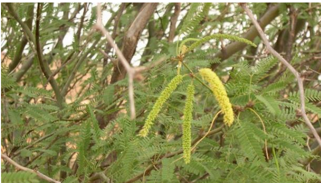
Mesquite flowers