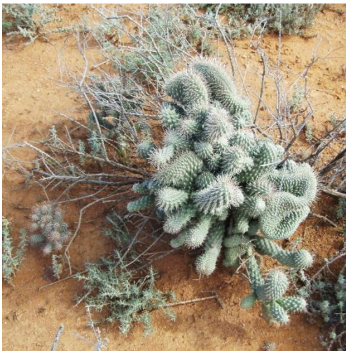
Coral Cactus plant

Usually 1-1.5 m high and occasionally up to 3 m. Upper segments are smooth greyish to dark green, 6-70 cm long and 1-5 cm wide. Segments resemble coral as they mature. Spines (1-6) emerge from depressions, with white woolly hairs and minute bristles. Flowers dull red 2-3.5 cm wide, in late spring to summer. Fruit is yellow-green, spiny, barrel shaped. Originally from Ecuador and Peru, it is unknown when or why it was introduced. Floodwaters may damage plants and also disperse segments resulting in new infestations.