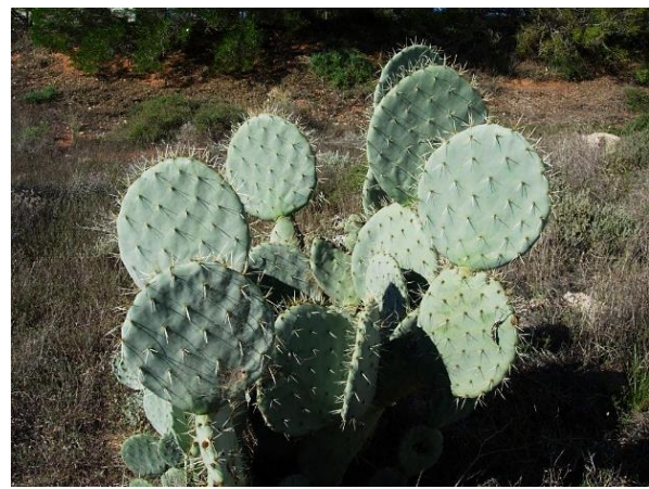
Wheel Cactus segments