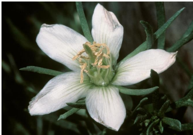
African rue flowers