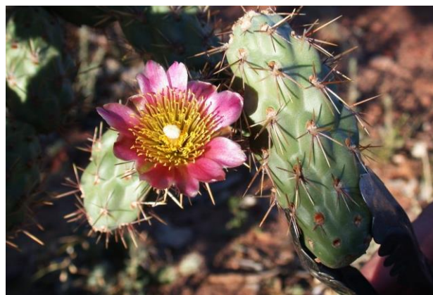
Jumping Cholla flower