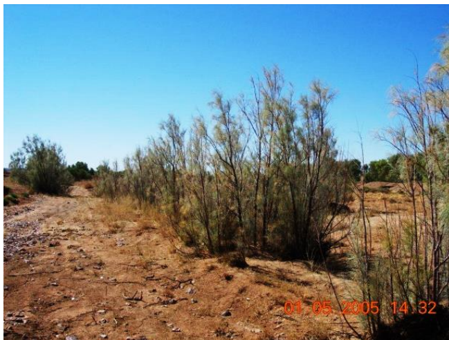
Athel pine in riparian zones