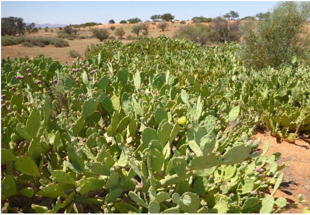
Prickly Pear plant