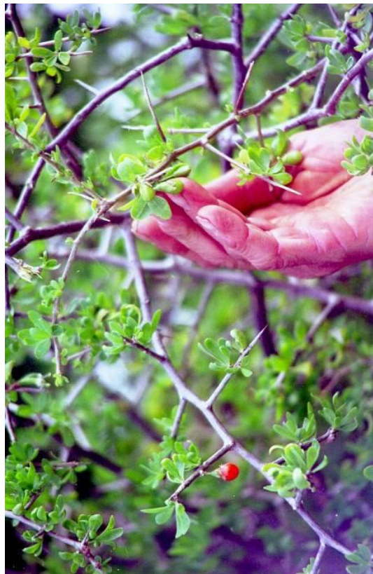
Immature and mature fruit