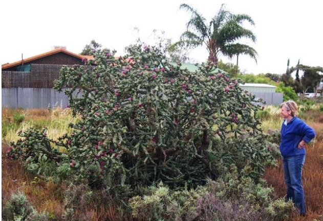
Mature Devil's Rope Cactus

Usually 1-2 m high and occasionally up to 3 m, often with a woody trunk. The plant is made up of strong woody segments dark to grey-green which are rope like in appearance. Sharp spines (2-30) emerge from depressions in segments, spines, 2-3 cm long, enclosed in yellow bristles. Flowers are 3-7.5 cm wide, purple or purplish-red, in late spring to summer. The fruit is usually spineless, barrel shaped and matures to a yellow colour. Originally from southern USA and Mexico, it is unknown when it was introduced but used as an ornamental garden plant. Previously called Opuntia imbricata .