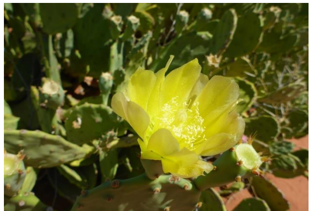
Prickly Pear flower