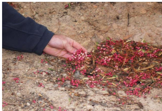
Mature fruit