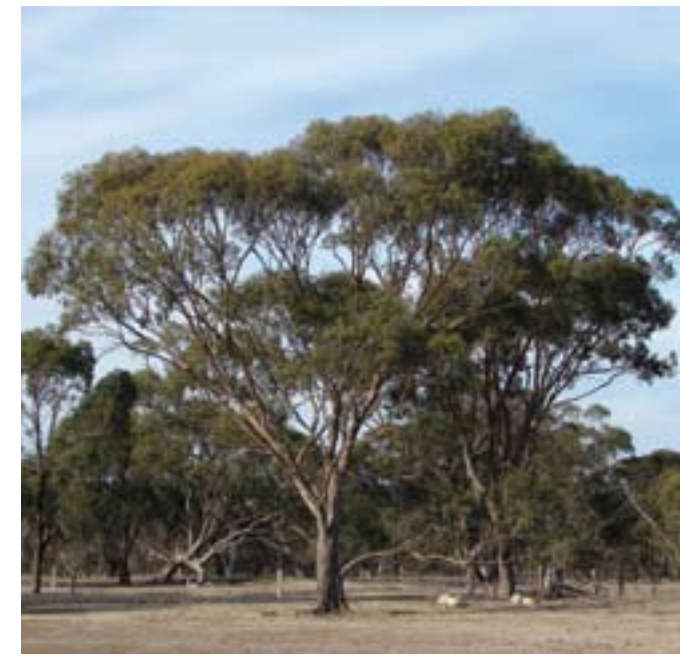
Grey Box paddock tree

Grey Box Woodland is also home to other threatened plant species such as the Pink Mulla-mulla (Ptilotus exaltatus var. semilanatus) and Leafy Templetonia (Templetonia stenophylla).