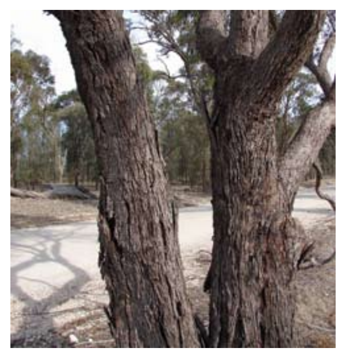
Grey Box bark