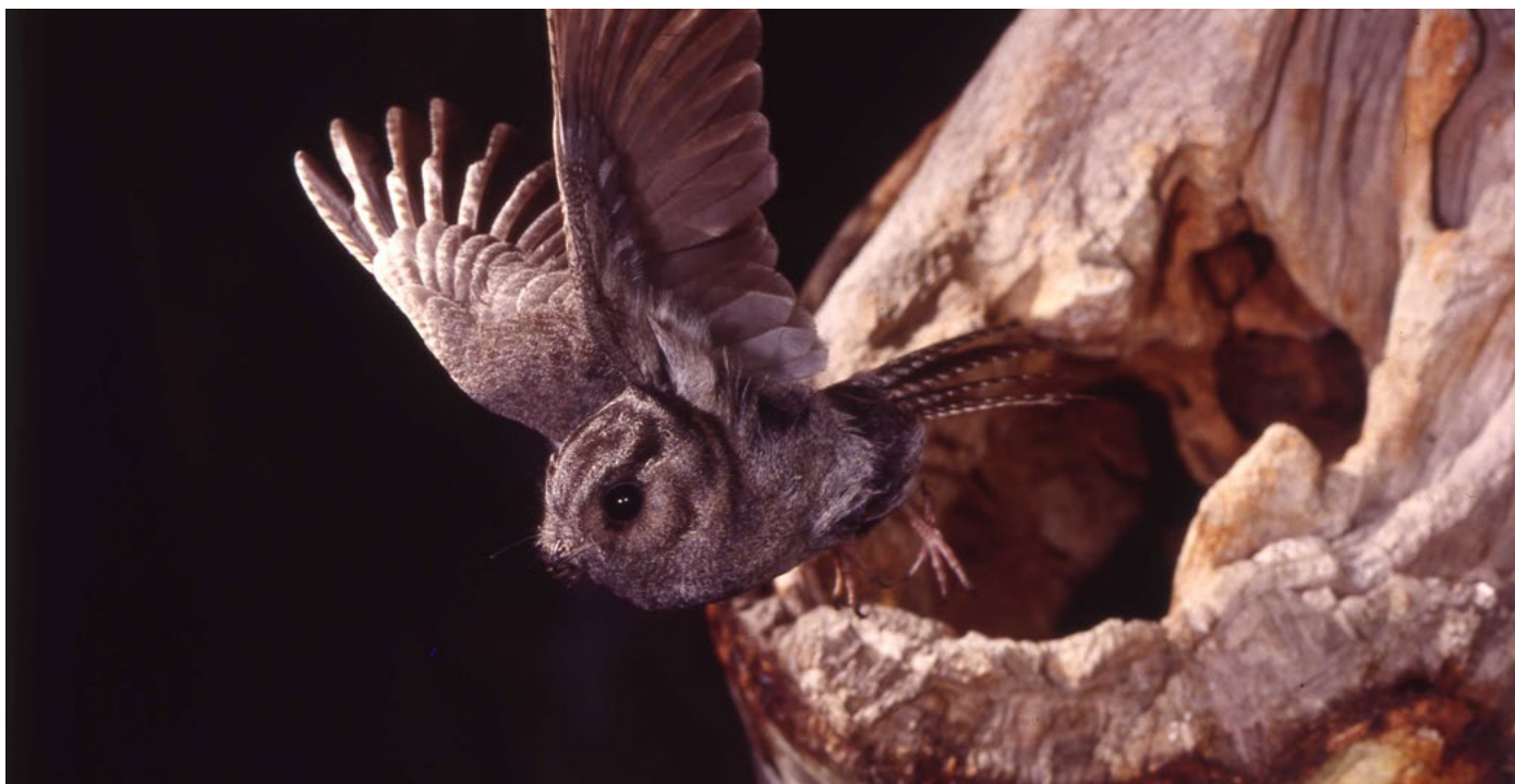
A local insectivore, the Owlet-nightjar makes its home in tree hollows.