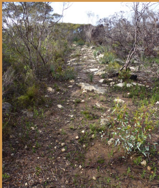
Eucalypts resprout following the Bangor fire

If you are concerned about a tree, a qualified arborist will be able to provide advice on whether it is likely to be a risk or not.