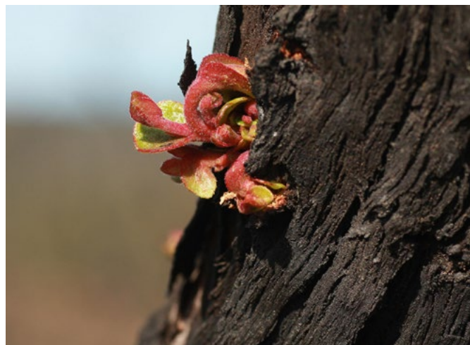
Watch with wonder as new eucalypt leaves push their way out from beneath burnt bark

For further information about managing native vegetation to reduce bushfire risks, refer to the CFS website: www.cfs.sa.gov.au .