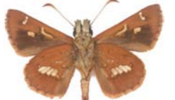
Barred Grass-skipper Dispar compacta