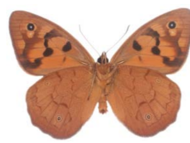
Shouldered Brown Heteronympha penelope