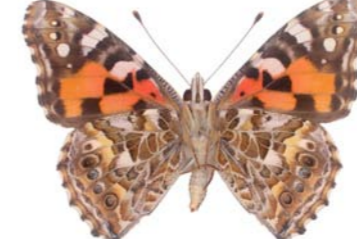
Australian Painted Lady Vanessa kershawi