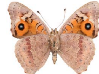
Meadow Argus Juvonia villida calybe