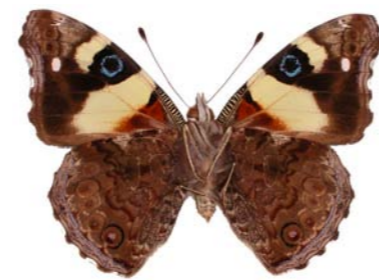
Yellow Admiral Vanessa itea