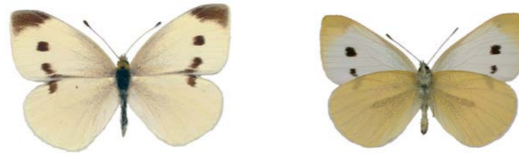
Cabbage White (I) Pieris rapae