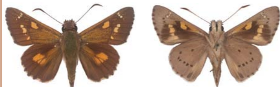
Varied Sedge-skipper Hesperilla donnysa