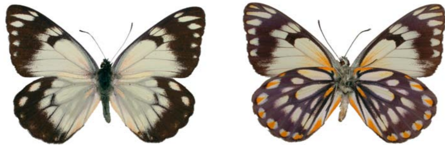
Caper White Belenois java teutonia