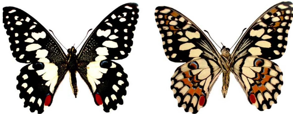
Chequered Swallowtail Papilio demoleus sthenelus