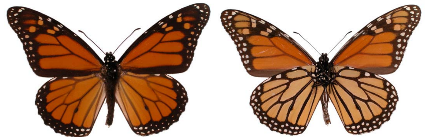
Wanderer (I) Danaus plexippus plexippus