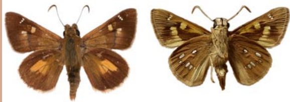
Golden-haired Sedge-skipper Hesperilla chrysotricha cyclospila