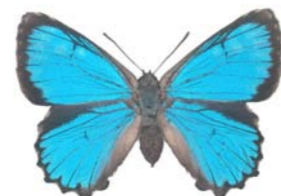
Satin Azure Ogyris amaryllis meridionalis