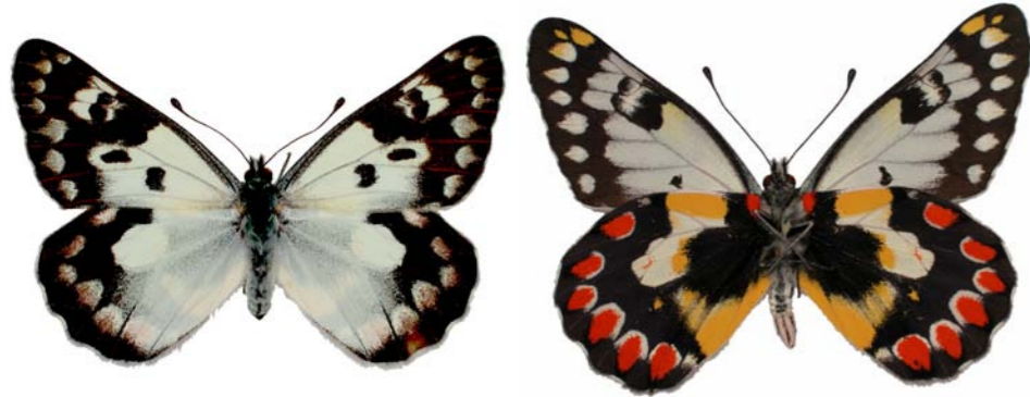
Spotted Jezebel Delias aganippe