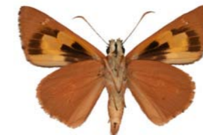
Flame Sedge-skipper Hesperilla idothea clara