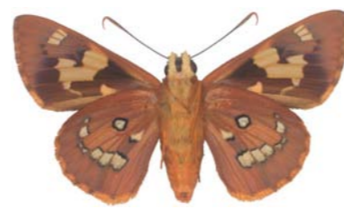
Splendid Ochre Trapezites symmokus