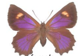
Dark Purple Azure Ogyris abrota