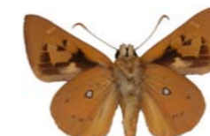
Orange Ochre Trapezites eliena