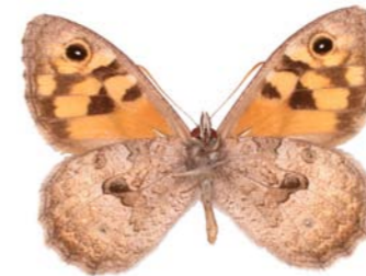
Marbled Xenica Geitoneura klugii