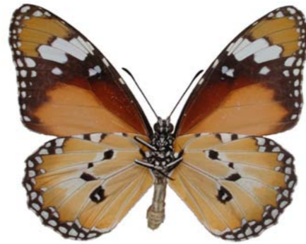
Lesser Wanderer Danaus petilia