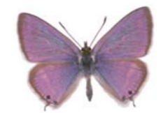
Long-tailed Pea-blue Lampides boeticus