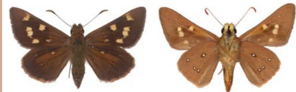
Large Brown Skipper Motasingha trimaculata trimaculata