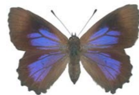
Broad-margined Azure Ogyris olane