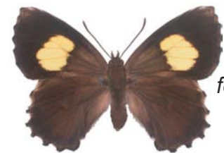
Large Brown Azure Ogyris idmo