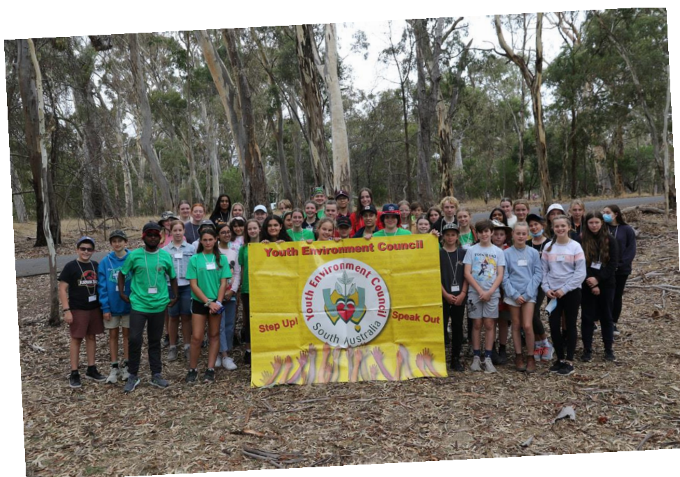
Statewide Youth Environment Council representatives at the 2022 Welcome Forum