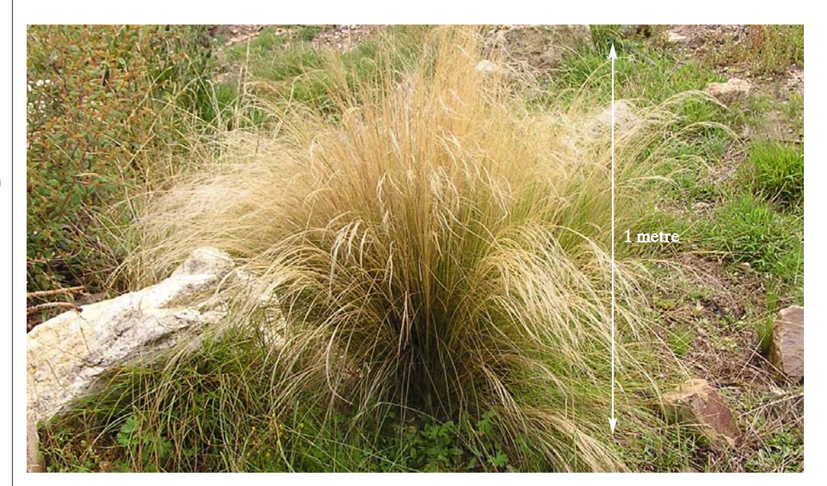
Mexican feather grass is a densely tufted perennial grass, closely related to Serrated Tussock