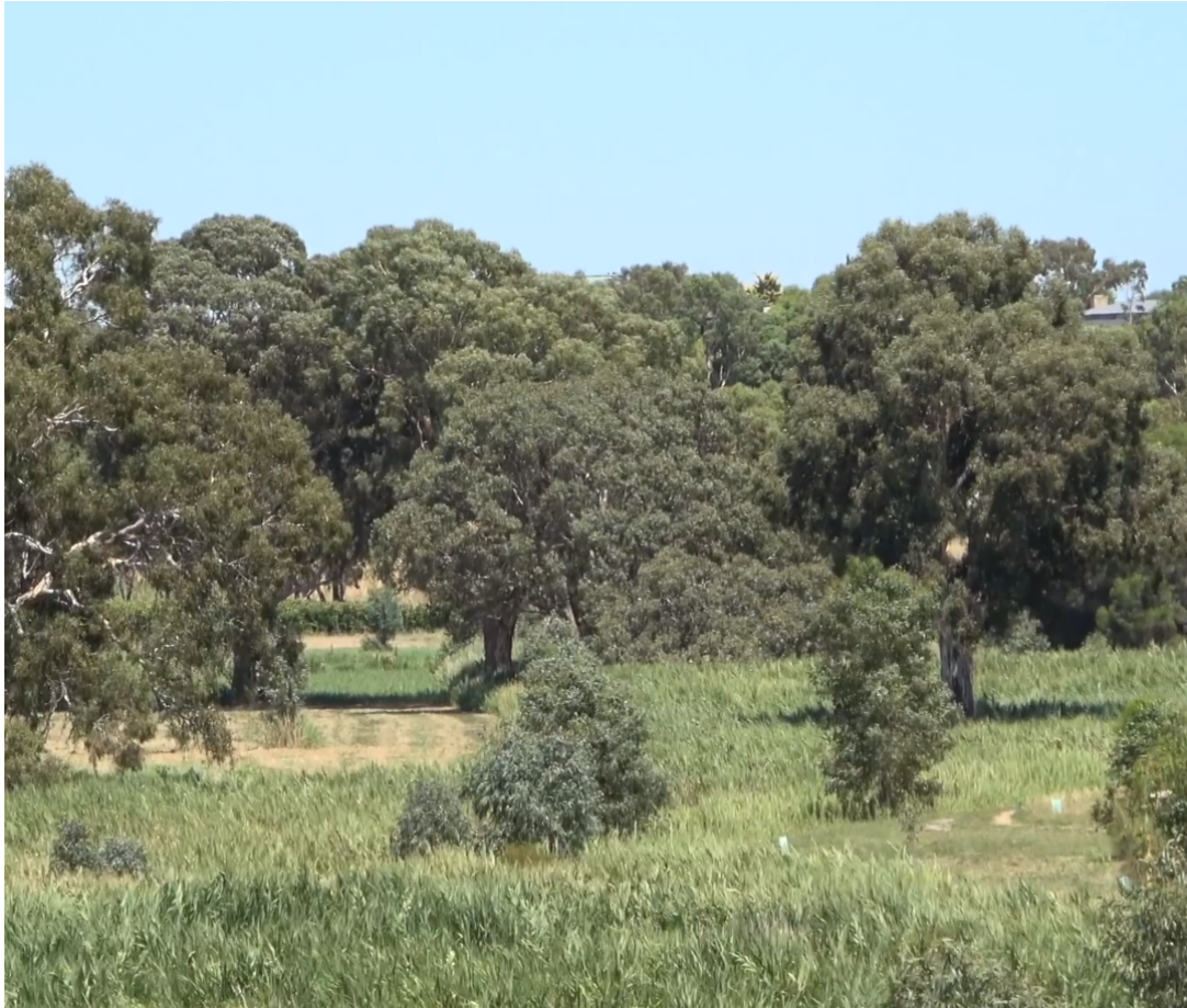
The restored landscape of Gavin's property.