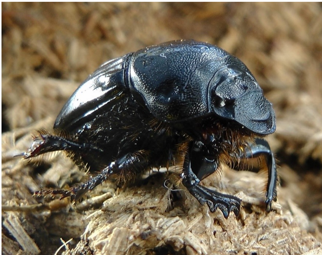
A female Bubas bison, one of the dung beetle species found in the Mount Lofty Ranges.