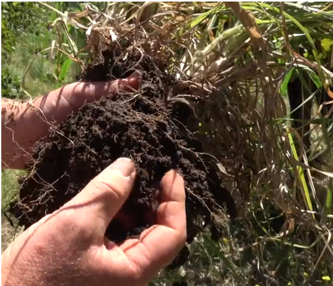
Soil structure around plant roots can give important clues to the health of the soil microbiome.