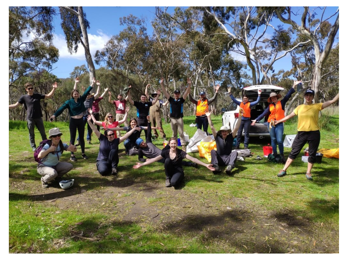
The Climbing Club of South Australia won a Grassroots Grant for their Morialta Crag Care project. The funds will be used to provide tools, guards and 250 native seedlings to revegetate a site in Morialta Conservation Park. This photo shows the Crag Carers after a morning of tackling weeds.