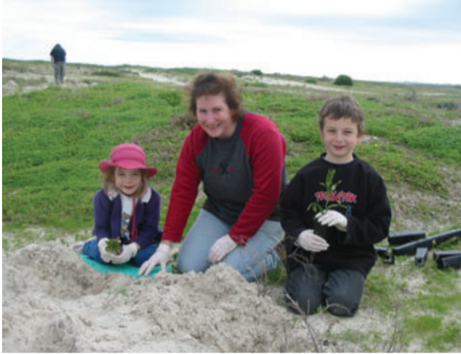
Dune planting with the SA Urban Forests - Million Trees Project

Take a stroll through the Semaphore to Outer Harbor sand dunes using the Coast Park shared-use recreational path. This area is currently being revegetated using native dune plants in conjunction with the installation of interpretive signage and seating.