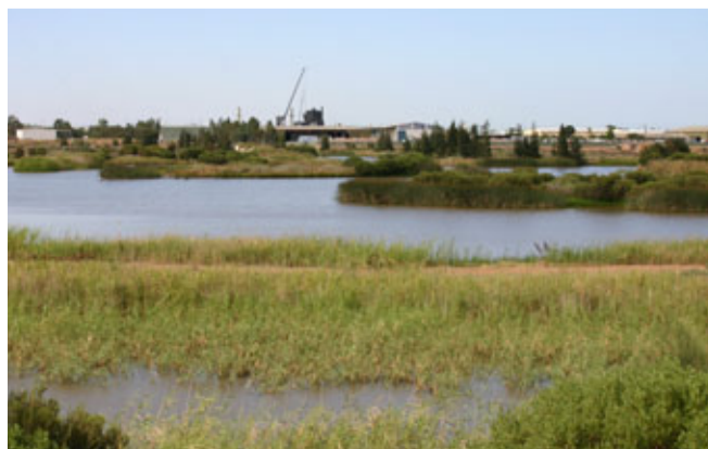
The Barker Inlet Wetlands at one of the viewing platforms

There are a number of constructed wetlands of national importance located throughout the area (see map). Wetlands are an important ecosystem, vital to the protection of the estuary. They act as natural water treatment areas; by filtering and removing pollutants they help to improve water quality. Wetlands also support a variety of wildlife, control erosion and detain large quantities of water.