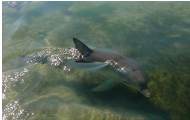
Local resident, Bonnie the Bottlenose Dolphin

About 250 Bottlenose Dolphins have been identified in and around the region, with 20 to 30 of these considered to be permanent residents. Unfortunately, these dolphins have been subjected to various urban and industrial pollutants, heavy boat traffic and strikes, entanglements, harassment and deliberate attacks by humans. To alleviate these pressures and to protect the dolphins and their habitat, the Adelaide Dolphin Sanctuary has been established (2005).