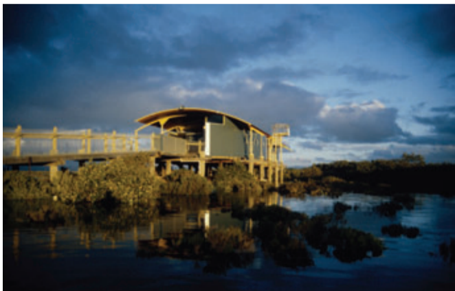
St Kilda Mangrove Trail and Interpretive Centre

A mangrove is a woody plant or plant community found in estuarine areas. Mangroves are important as they provide habitat and food for many fish, crustacean and bird species, as well as trapping large amounts of silt and building up mudflats. In the Barker Inlet and Port Adelaide River system, mangroves can be found around North Arm Creek, Garden and Torrens Islands, Port Gawler, Middle Beach and St Kilda.