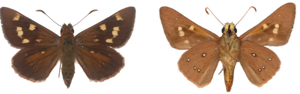
Large Brown Skipper