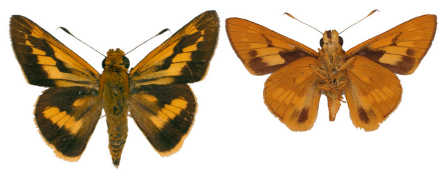
Orange Palm-dart (I)