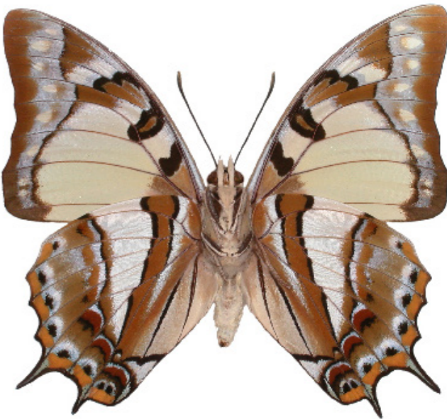
Tailed Emperor (I)