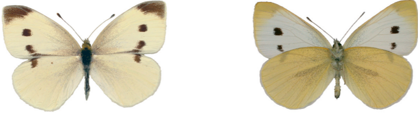
Cabbage White (I)