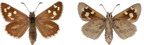
Black and White Sedge-skipper