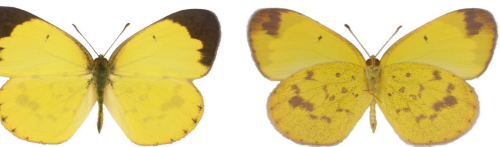
Small Grass Yellow

WHITE or CREAM with BLACK or BROWN Medium sized (2.5cm - 6cm) or Large sized (>6cm)