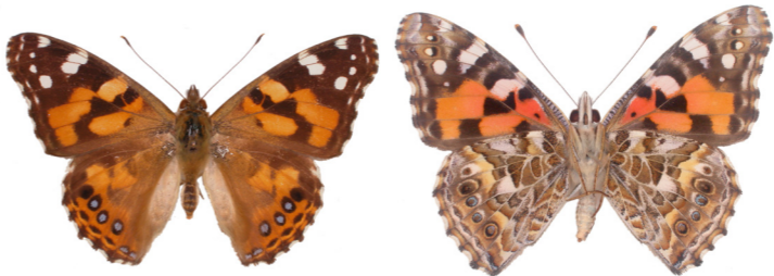
Australian Painted Lady