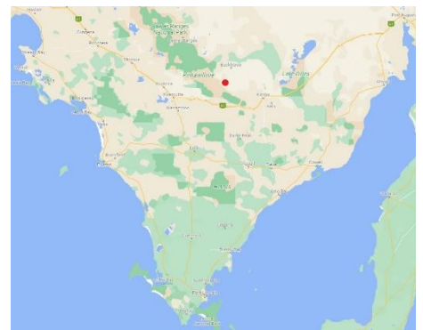
The Pinkawillinie area is between Kimba, Kyancutta, and Buckleboo.

The average annual rainfall is 308 mm and average growing season rainfall 211 mm. In 2020, the growing season rainfall was below average for April-September (185 mm), though total rainfall for the year was above average at 340 mm, which included 90 mm falling in late October.