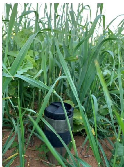
Figure 1. Left: Early emergence of the mixed species treatment in autumn 2020.