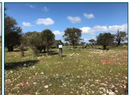
Examples of photopoint data showing changes over 10 years natural regeneration (top) and growth of native pines (bottom)