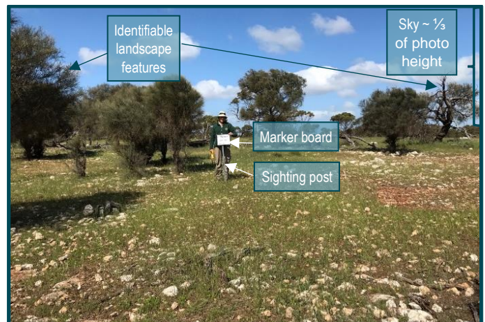
Photopoint photo setup