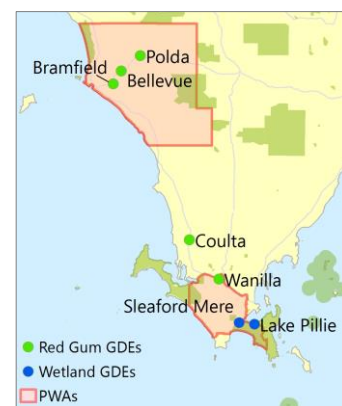
Location of GDE monitoring sites

The GDE monitoring program has been designed so that the effects of factors we can control (water extraction) can be distinguished from those we cannot (climate variability). We therefore monitor licensed extraction sites, located in the areas that can be influenced by water extraction activities, and also monitor control sites. Control sites are located where conditions are similar to those at the licensed extraction sites, except they are located outside the areas that can be influenced by water extraction. We can identify the effects of uncontrollable influences at the control sites. Then, comparing the control sites to the licensed extraction sites, we can distinguish any additional effects that are caused by water extraction. Five Red Gum GDE sites (three licensed extraction and two control) and two wetland GDE sites (one licensed extraction and one control) have been selected for monitoring.