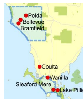
Location of GDE monitoring sites

The GDE monitoring program has been designed so that the effects of factors we can control (water extraction) can be distinguished from those we cannot (climate variability). We therefore monitor licenced extraction sites, located in the areas that can be influenced by water extraction activities, and also monitor control sites. Control sites are located where conditions are similar to those at the licenced extraction sites, except that they are located outside the areas that can be influenced by water extraction. We can identify the effects of uncontrollable influences at the control sites. Comparing the control sites to the licenced extraction sites, we can then distinguish any additional effects that are caused by water extraction. Five Red Gum GDE sites (three licenced extraction and two control) and two wetland GDE sites (one licenced extraction and one control) have been selected for monitoring.